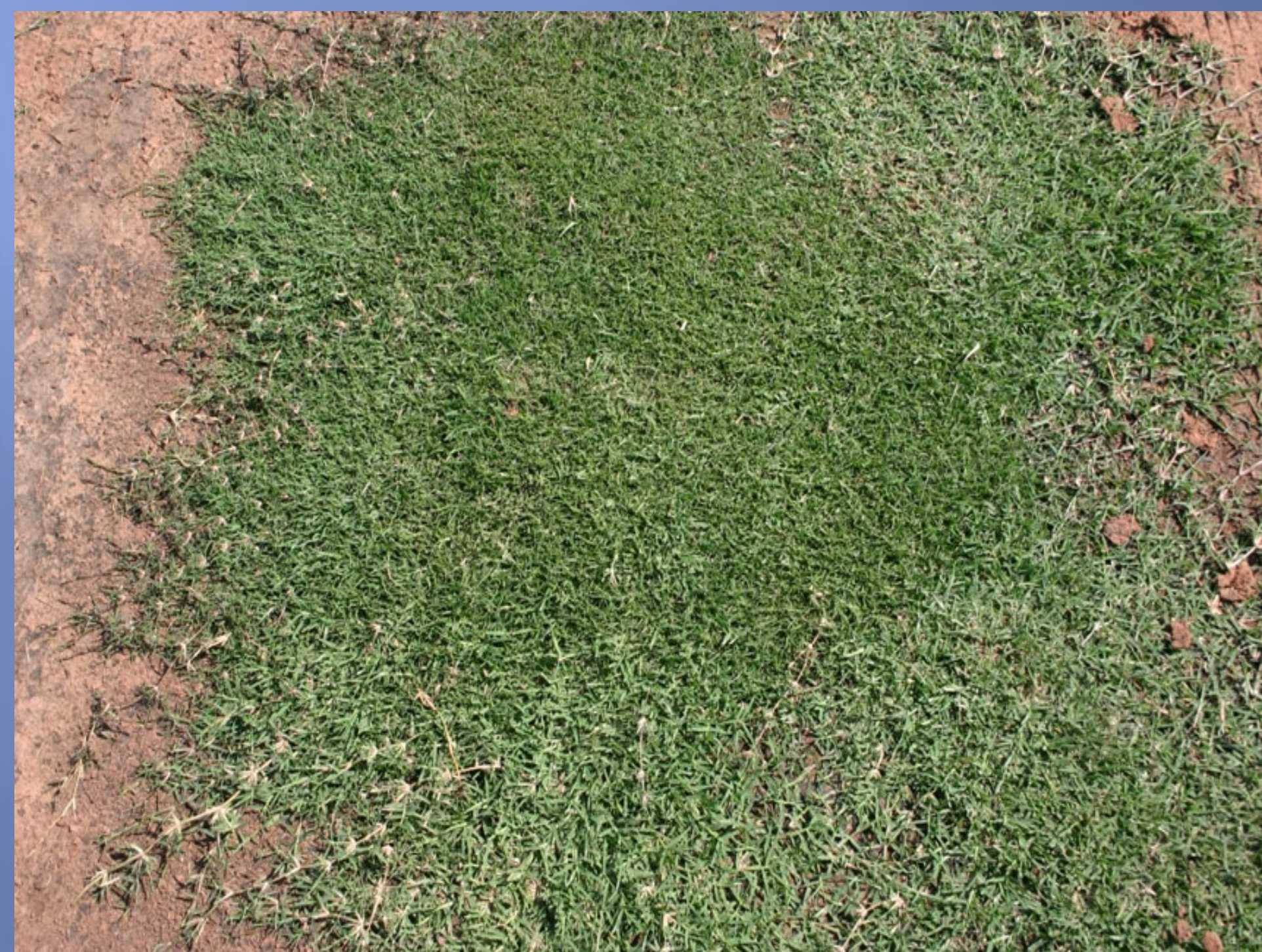
Photo 1. The stark contrast in color, texture, density and growth habit between an aggressive common bermudagrass and TifSport hybrid bermudagrasses reduces the visual quality of this turfgrass plot.

Evaluate 'Patriot', 'TifSport' and 'Tifway' hybrid bermudagrasses ( C. dactylon X C. transvaalensis ) for their ability to compete against 'TGS U-3' under simulated golf course fairway conditions. TGS U-3 is a local sod farm selection of common bermudagrass ( C. dactylon ) that is aggressive and has been widely utilized in the southern great plains in golf courses, lawns, grounds, sports fields and roadside right of way.