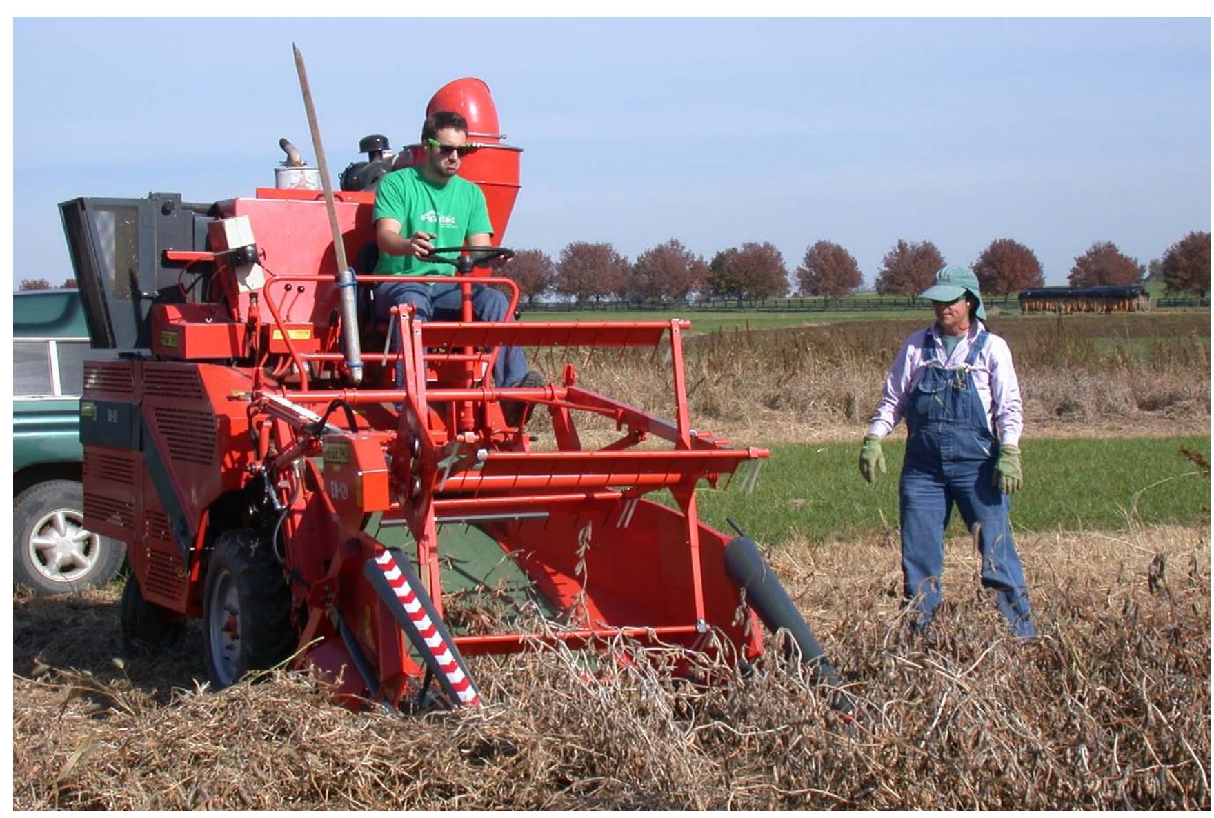
Picture 4. Harvesting soybeans with a small-plot Hege combine.

In summation, the no-till rye treatment outperformed the conventional till vetch in most aspects of study. The amount of manual weed control needed to achieve, on average up to six weeks, to match the no-till treatments in weed suppression and yield is tremendous. Upon further research and consultation, organic farmers may find considerable utility in combining no-till agriculture with weed suppressing winter cover-crops.