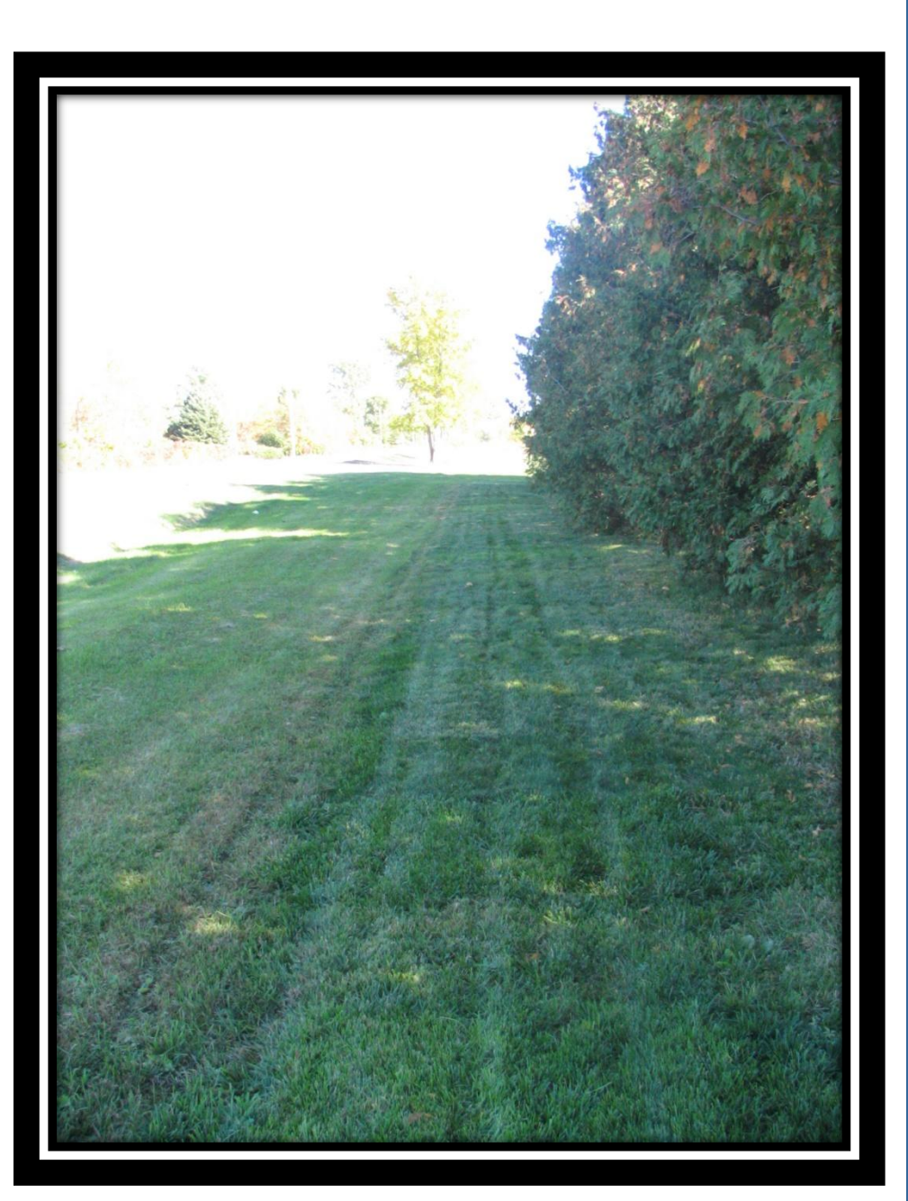
Figure 2. Photos of plots taken on 10 October 2008 showing extent of mid-day shade across plots.