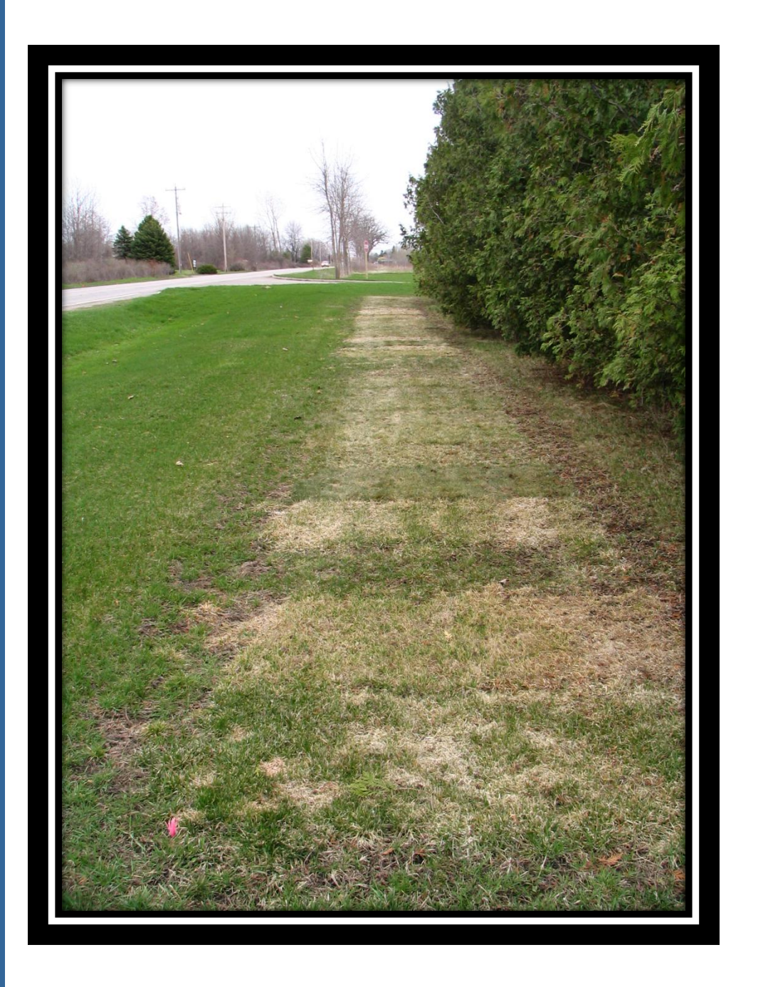
Figure 1. Photo of plots during spring green-up taken on 24 April 2008.

Seedbed was prepped with a verticutter operated in two directions. Plots were established on 20 September 2006 and received no supplemental irrigation during establishment or maintenance. Seeding rate for each species/cultivar was calculated to provide 25 PLS/in<sup>2</sup>. Plots received a starter fertilizer, 15-24-8 (Spring Valley), applied at a nitrogen rate of 1 lb/1000 ft<sup>2</sup> at time of establishment. Additionally, plots were fertilized on 22 May 2007 and 29 May 2008 with a 34-0-11 (Spring Valley) at a nitrogen rate of 0.75 lb/1000 ft<sup>2</sup>. No herbicide was during applied observation period.