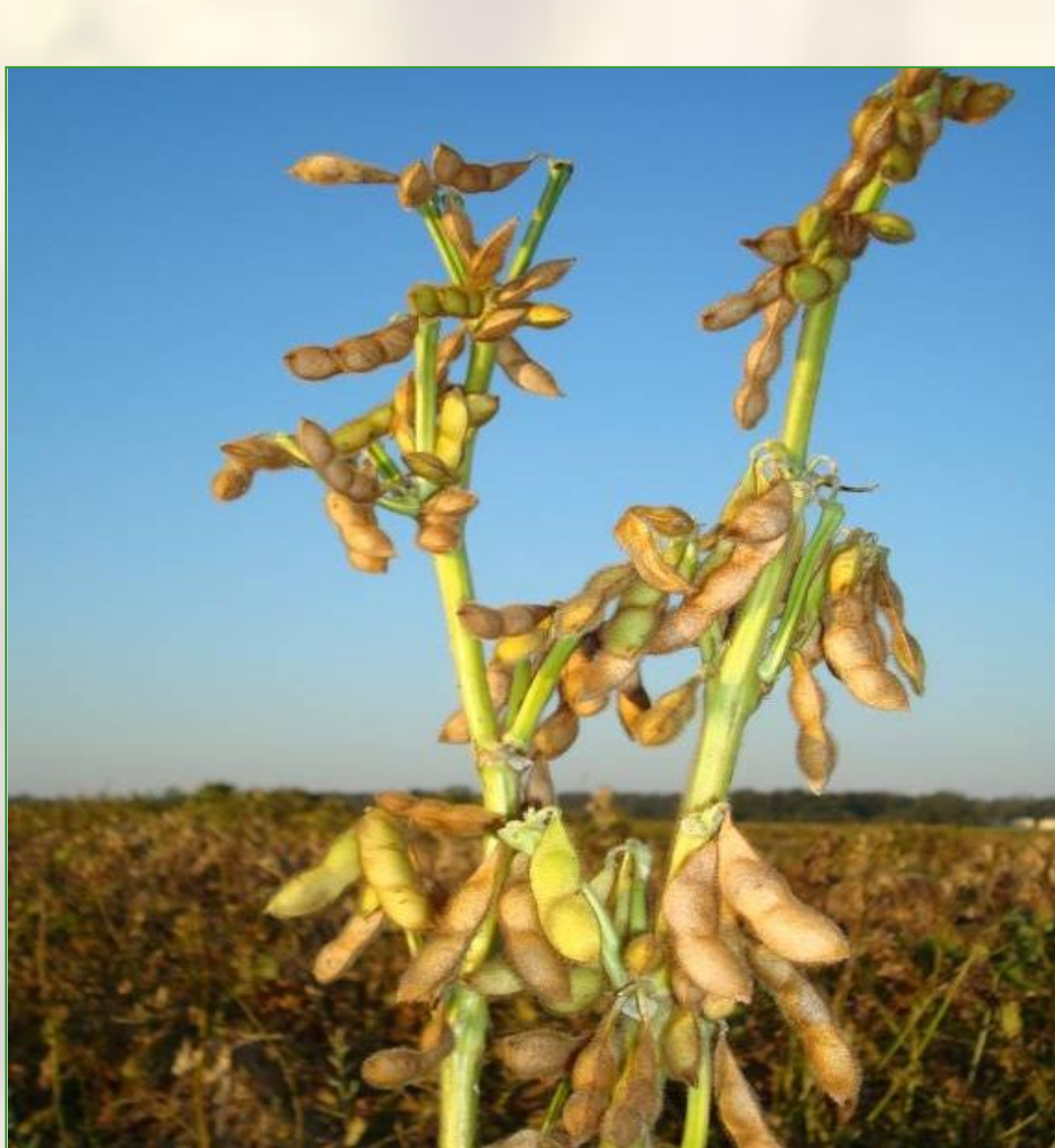
Bragg (old cultivar)