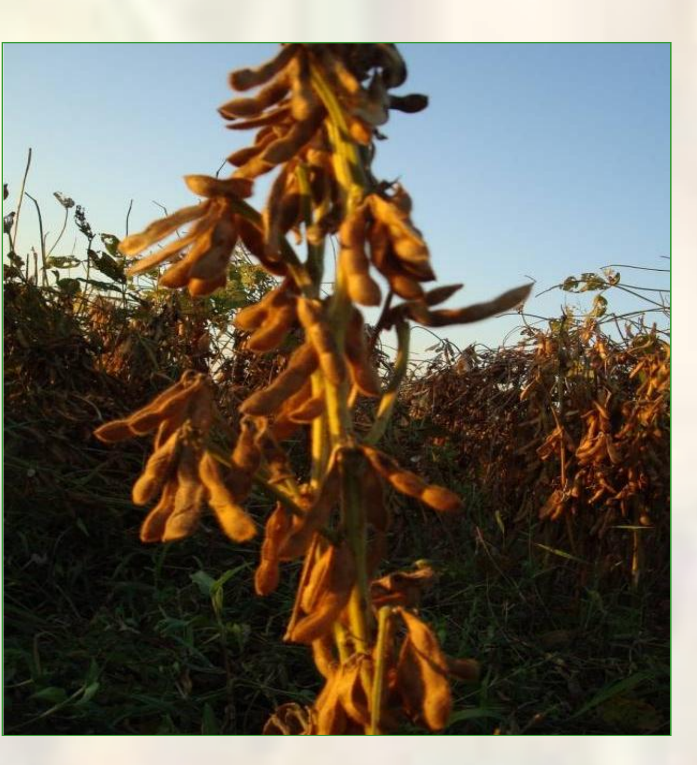
TN5-95 (new cultivar)

Data were recorded on the following yield components and growth parameters: seed size, seed number per area, seed per pod, pod number per area, pod per reproductive number (reproductive node has at least 1 pod), reproductive node number per area, percent reproductive nodes (% of nodes becoming reproductive), node number per area, harvest index, total dry matter (TDM). Data were also taken on days to R5, R7, R5-R7, and lodging.