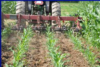
Figure 3. Row cultivating last planted corn