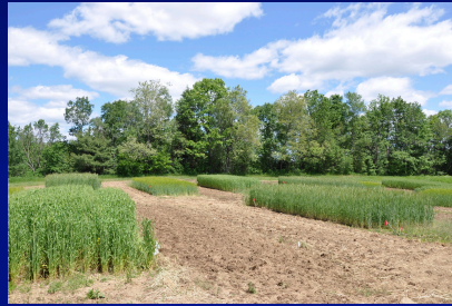
Figure 2. Small grains following BS harvest