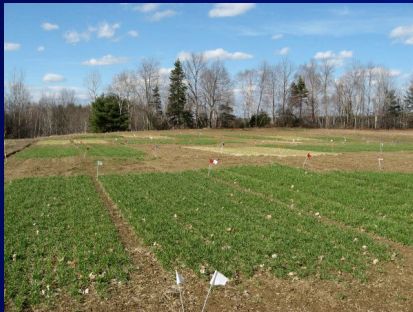
Figure 1. Winter barley survival questionable