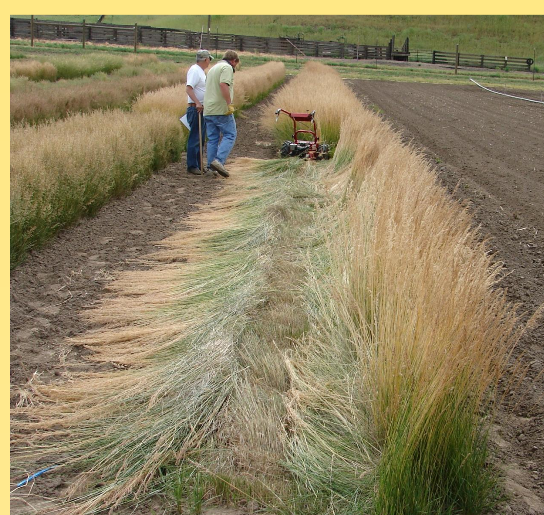
Fig. 5 Harvesting bluegrass seed increase plots at the USDA-ARS research site at Central Ferry, WA