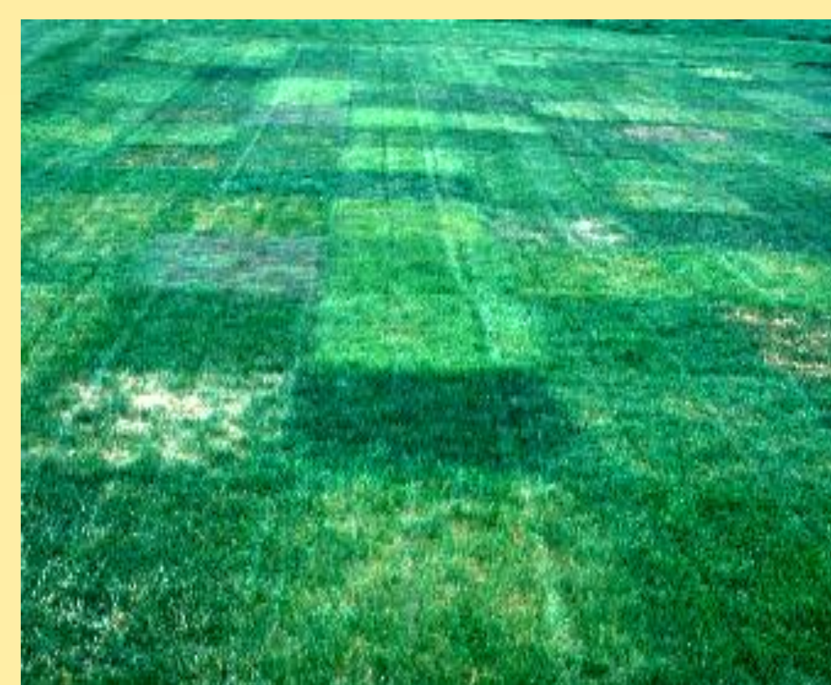
Fig. 3 Turfgrass evaluation: turf quality; texture; color; etc.