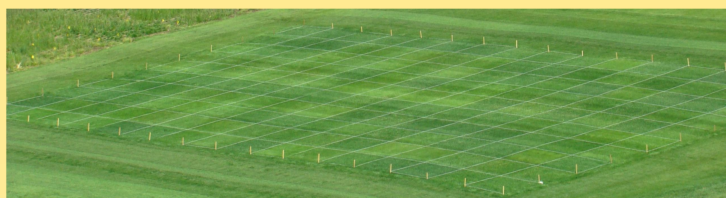
Fig. 6 Turfgrass evaluation at Pullman, WA