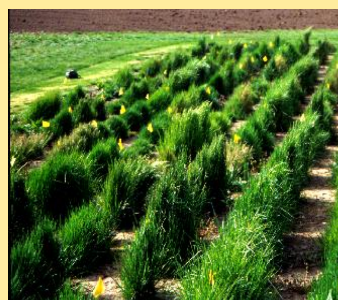
Fig. 1 USDA-ARS Kentucky bluegrass collection evaluation

The turfgrass trial was evaluated monthly (2007 and 2008) according to National Turfgrass Evaluation Program (NTEP) protocol. In 2008, seed production plots were harvested, threshed, cleaned, and seed yield was determined.