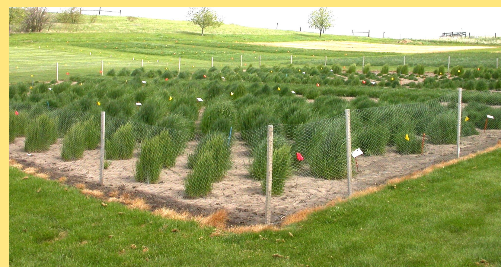
Fig. 4 Space-plant nursery for individual plant characterization