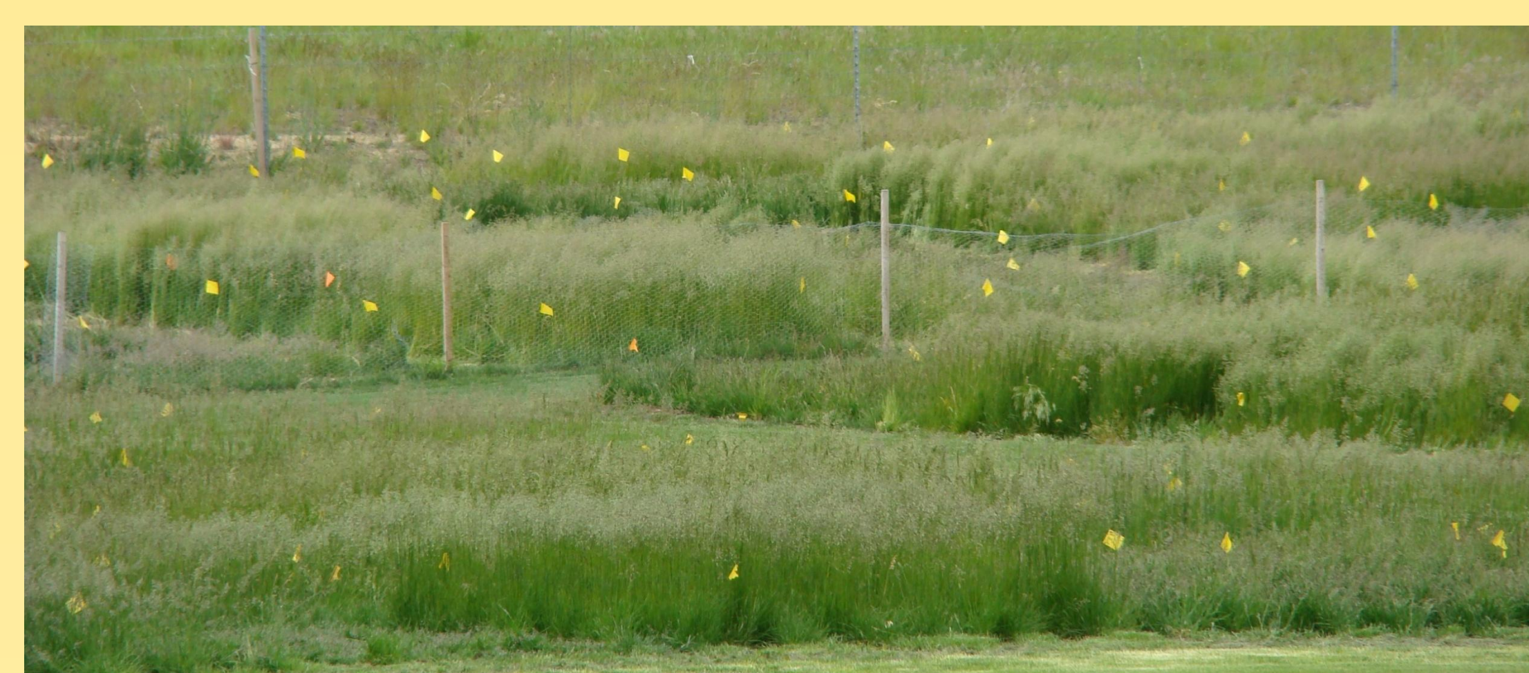
Fig. 7 Seed production evaluation at Pullman, WA