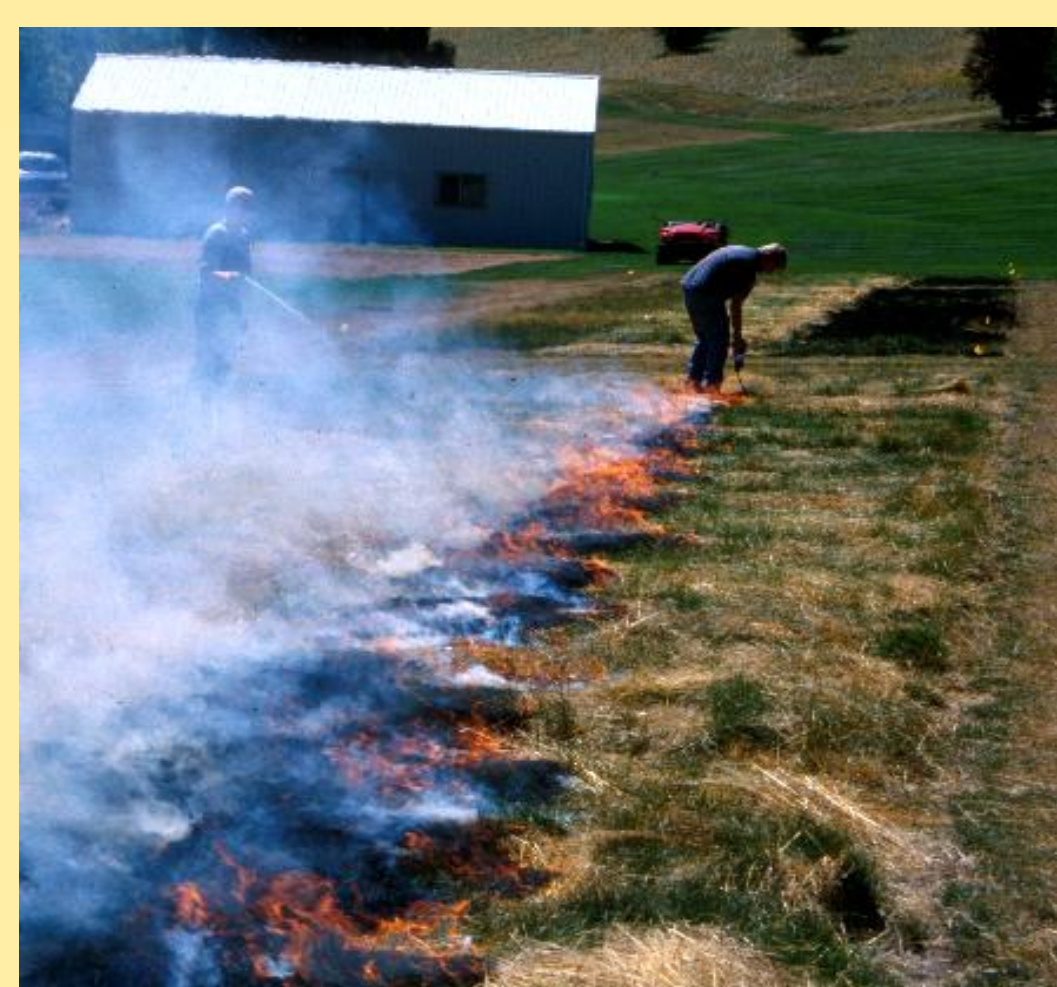
Fig. 2 Seed plot treatments: burning; baling; full residue