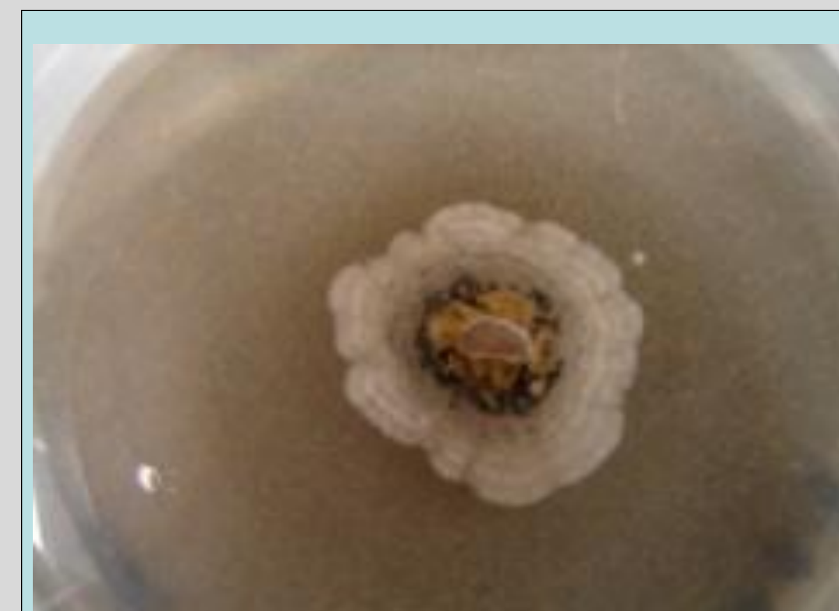
Pa = Phomopsis amaranthicola