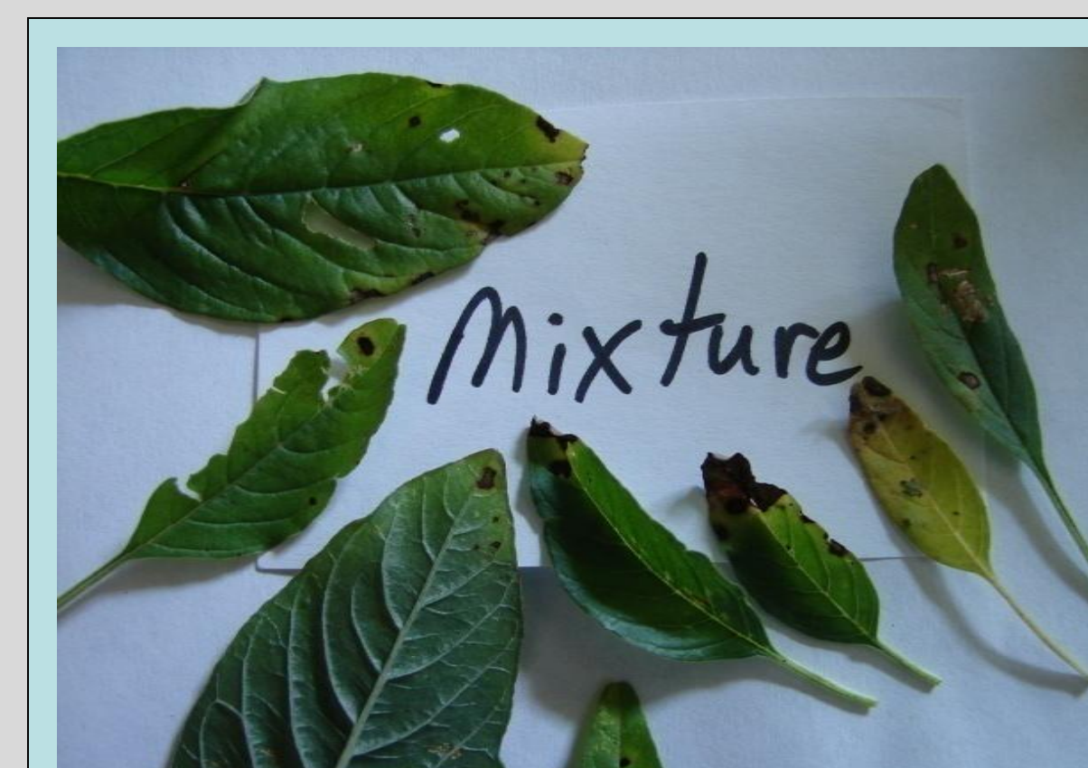
Disease lesions on leaves from Ma and Pa Mix Treatment