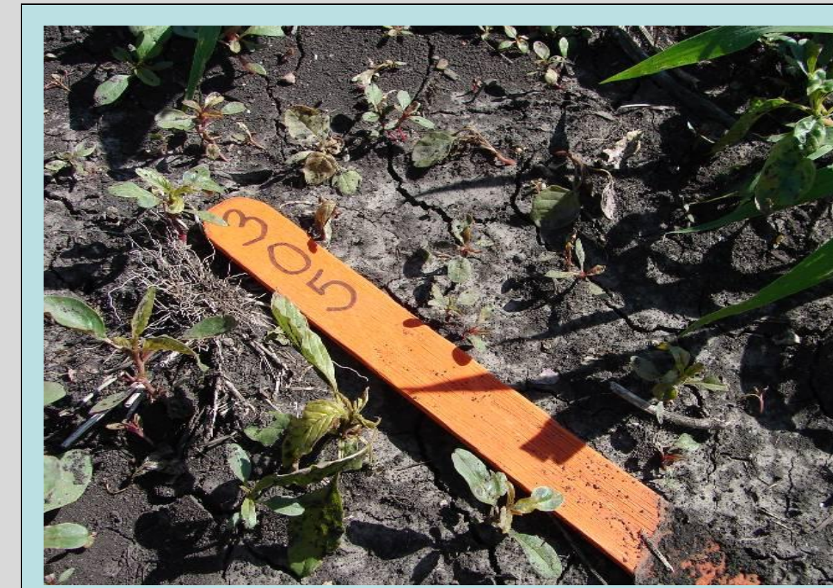
Weed mortality from Sandea followed by Ma Treatment