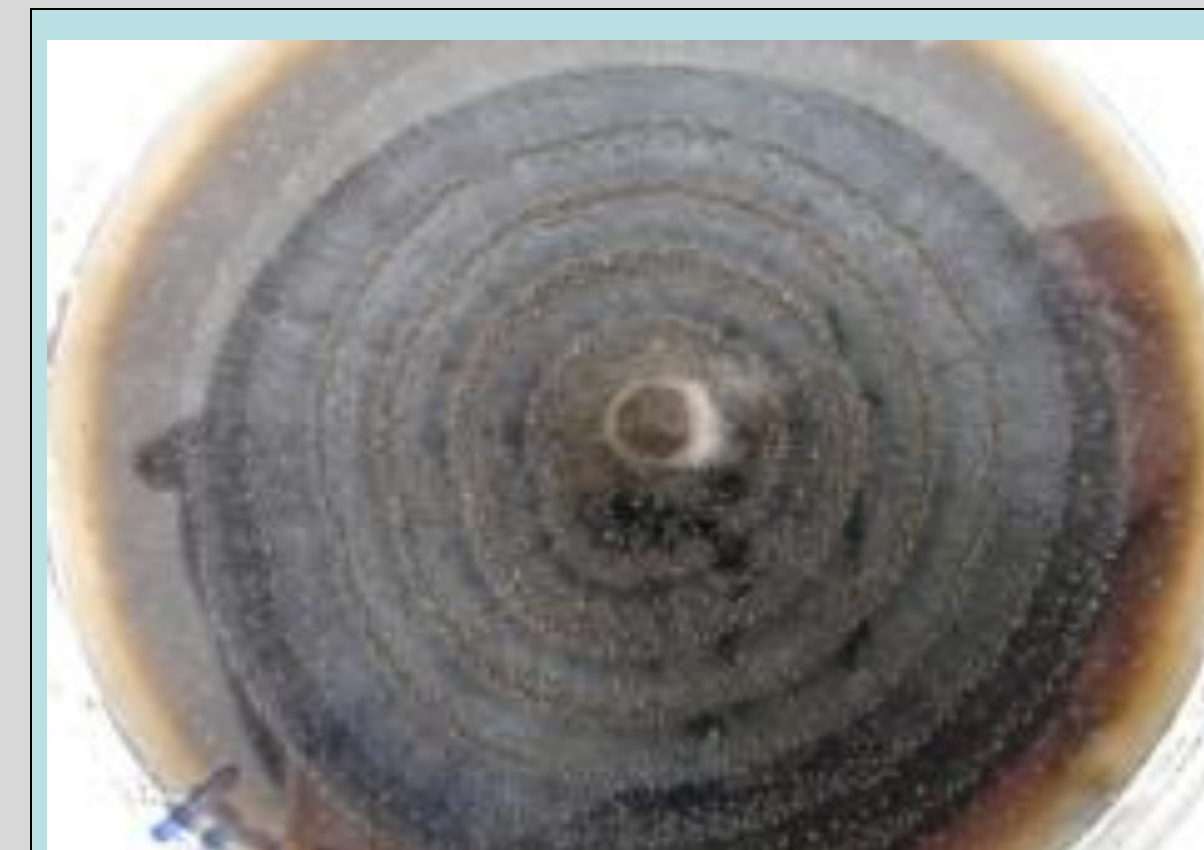
Ma = Microsphaeropsis amaranthi