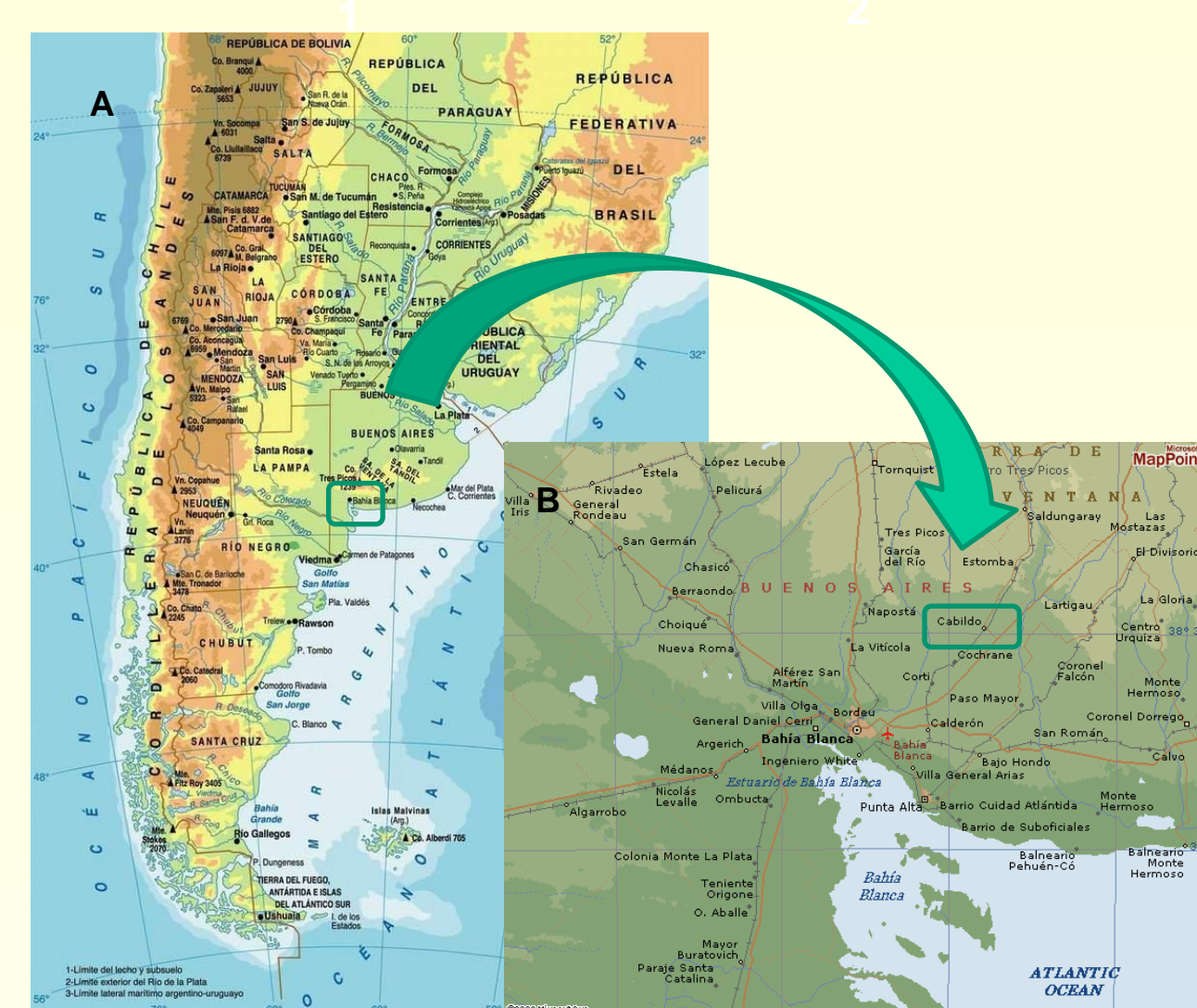
Figure 1. Experimental field location at Asociación de Cooperativas Agronómicas (ACA) - Cabildo, Buenos Aires, Argentina. A. Physical map of Argentina and limiting countries. B. Physical map of Bahia Blanca and limiting counties including the location of the experimental field at Cabildo (39° 36' South, 61° 64' West).

Weeping lovegrass [ Eragrostis curvula (Schrad.) Nees] is a perennial C4 grass spread over tropical and subtropical regions worldwide. In Argentina, this forage crop covers 800.000 has; however it has potential to colonize marginal production areas due to its low input costs, fast growth and high biomass production in poor soils and semidesertic environments. Comparative studies showed that weeping lovegrass was more productive but with less forage quality than P. virgatum L., P. coloratum L. and T. dregei during two growing seasons (Stritzler et al., 1996). Further reports indicated that weeping lovegrass and pangolagrass ( D. eriantha ) produced over 80% biomass, and weeping lovegrass produced 22% more biomass than pangolagrass in the growing season during a four-year study. Its biomass production was given by a longer growing season that allowed two extra-cuttings in summer and a higher survival rate during winter (Gargano et al., 2001). However, weeping lovegrass forage quality is low (>7% CP) and limits animal performance. Nowadays, there are no weeping lovegrass breeding programs in our country. Therefore, we decided to evaluate weeping lovegrass quality and yield traits in commercial and newly developed cultivars growing in marginal areas from the south of Argentina, to determine their potential as forage crop to be included in breeding programs or biotechnological projects.