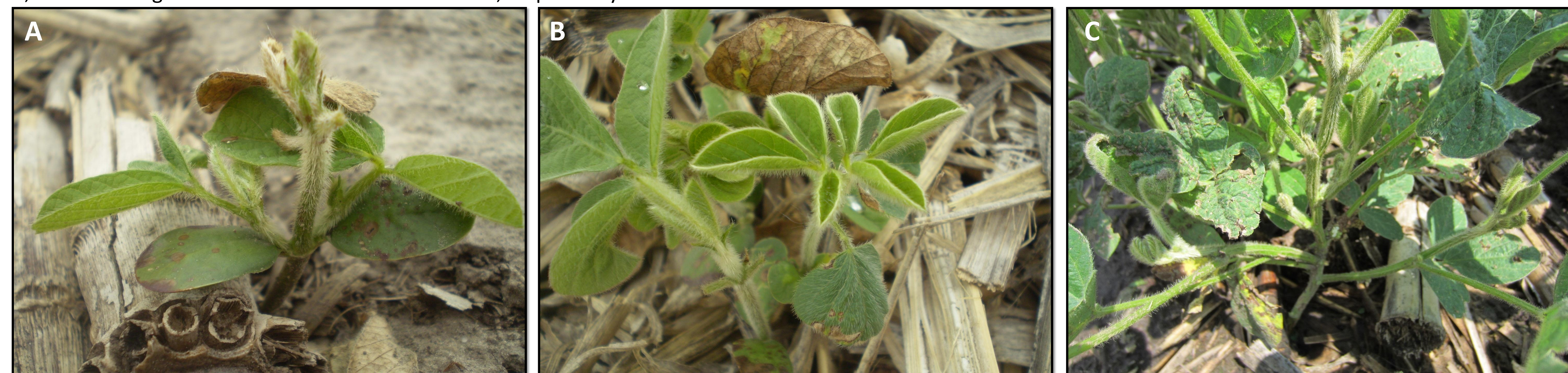
Response of soybean to lactofen application at V1 (A and B), and R1 (C).

*, ** indicate significance at the 0.05 and 0.01 levels, respectively