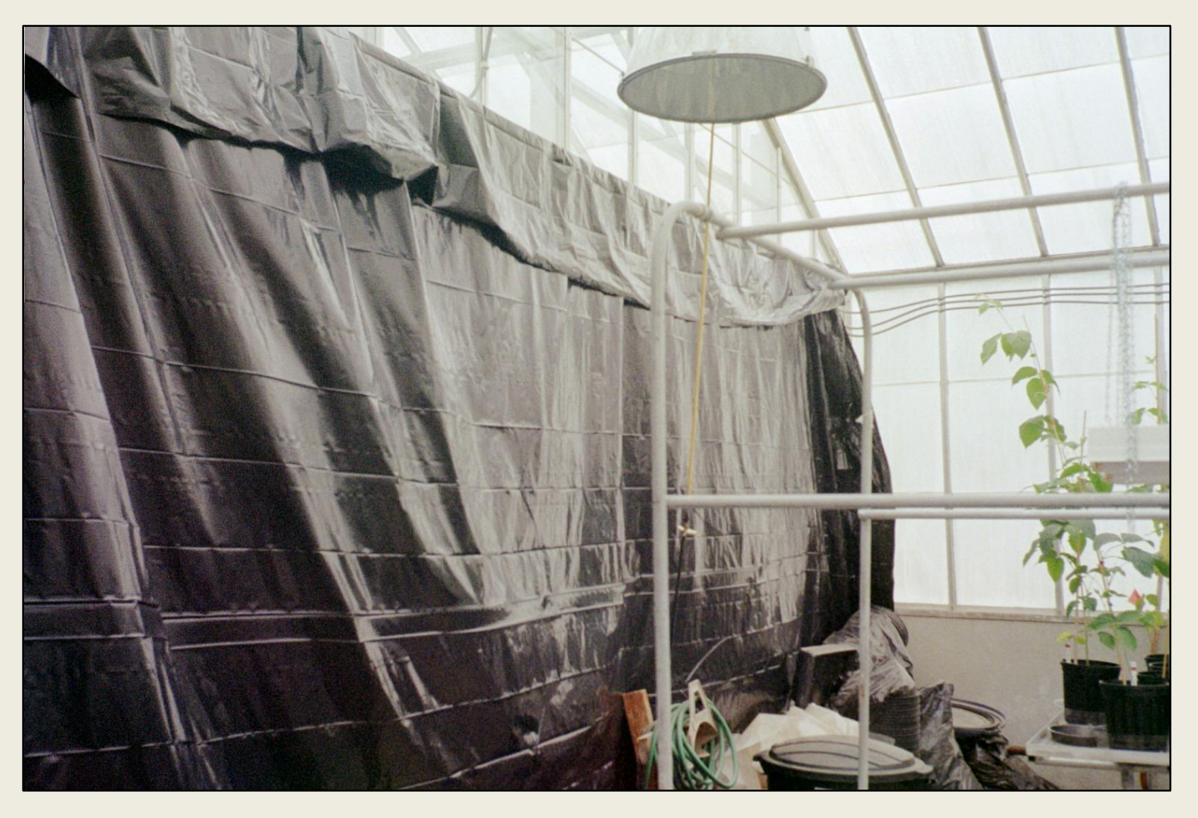
Fig. 1. Overview of the pots on 15 Sept. 2009