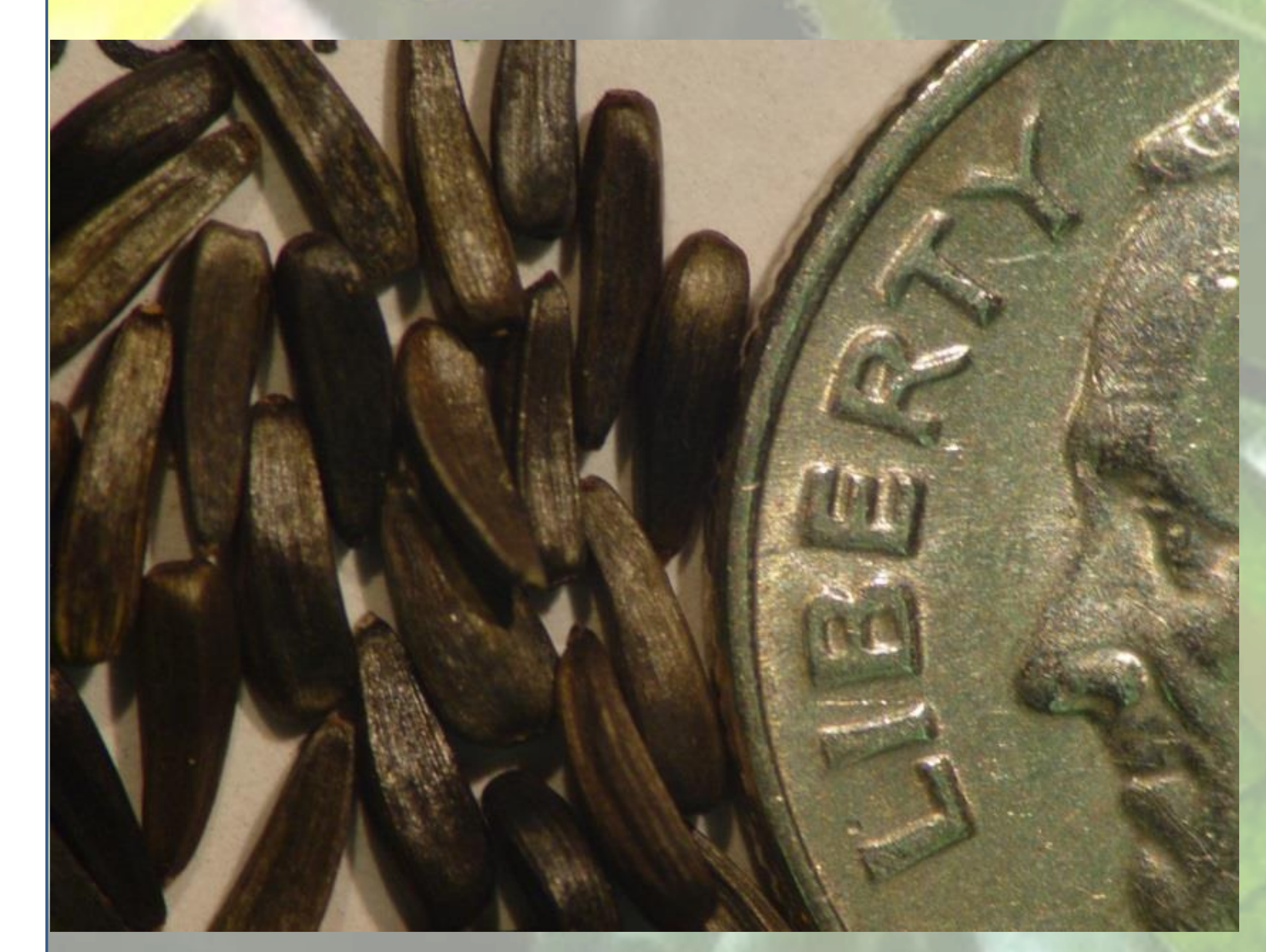
Niger seed placed with dime for size comparison

In the United States, Niger (Guizotia abyssinica L.) is primarily marketed as a seed of choice for American goldfinches (Spinus tristis) as well as other song and ground feeding birds because of its high oil content. In countries such as Ethiopia and India, niger is grown as an edible oilseed crop. Fourteen niger accessions of Indian, Ethiopian, and American origin were obtained from USDA/ARS germplasm collection at Pullman, WA and evaluated in summer of 2012 at the East Tennessee Research & Education Center.