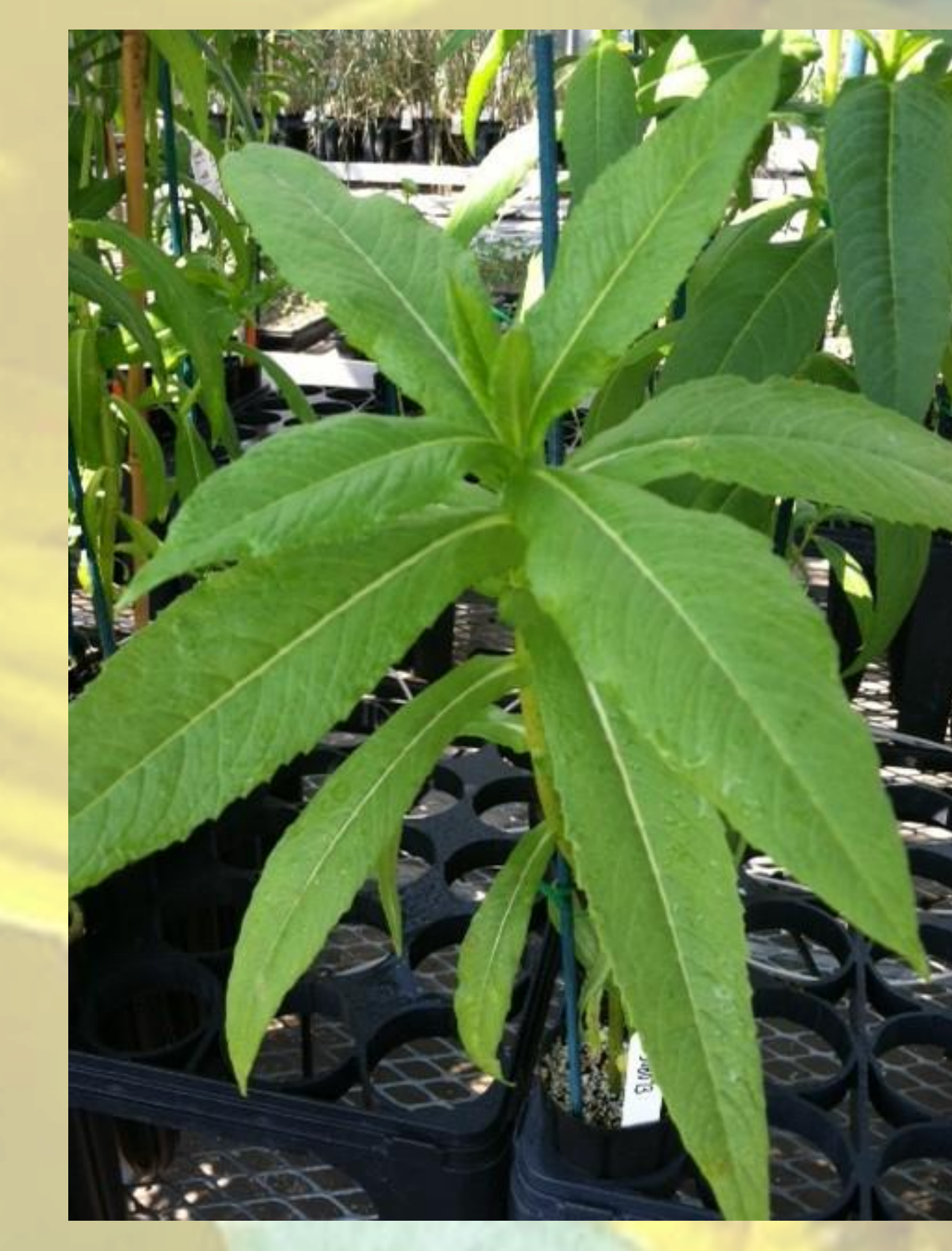
PI 508073 showing vegetative growth

A strong negative correlation (- 0.99) was found between oleic and linoleic fatty acid (P<0.0001).