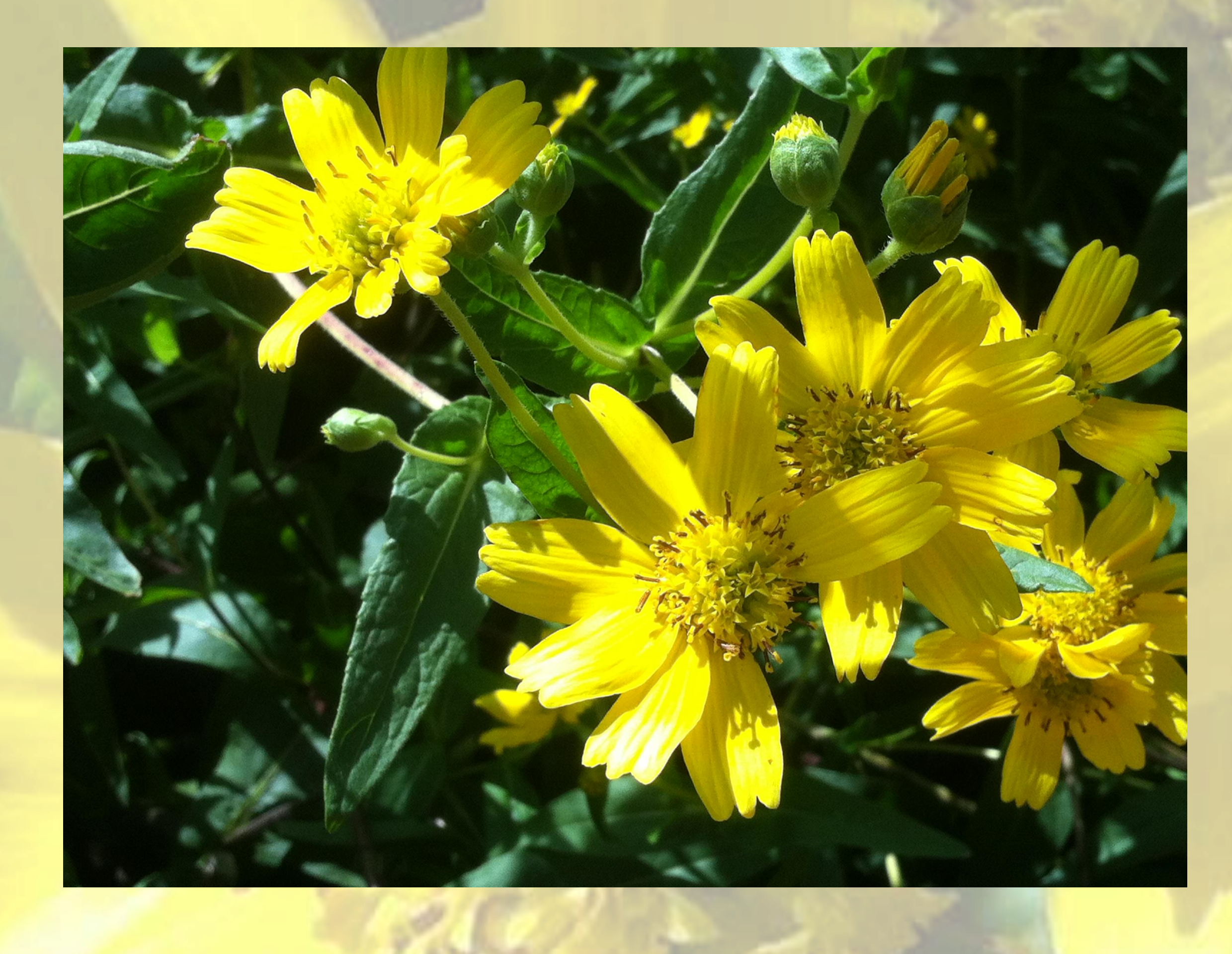
Fig. 2. Comparison of four major fatty acids among niger accessions. Seed were combined according to accession, and analyzed using Near Infrared Spectroscopy. The following graph shows the proportion of palmitic, stearic, oleic, and linoleic fatty acid. Mean separation according to Fisher's Least Significant Difference Test (P<0.05).

‡ Similar letters indicate values do not differ significantly according to Fisher's Least Significant Difference Test (P<.05) § PI508078 and PI508080 not represented in figure