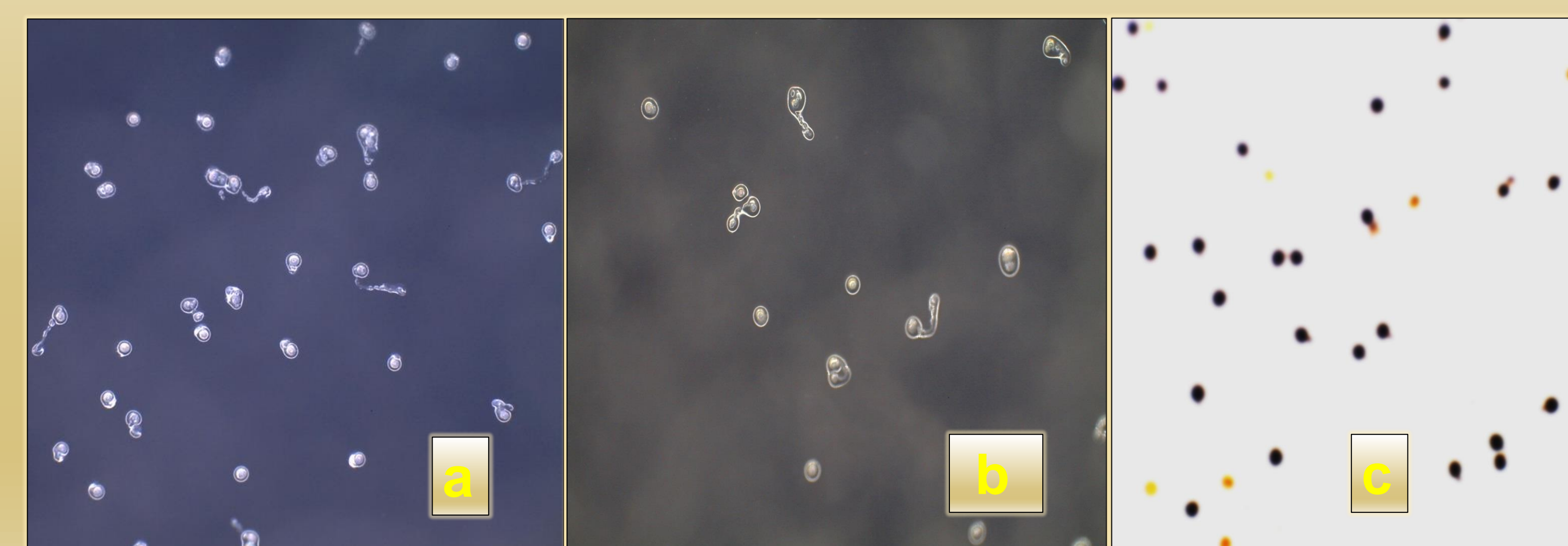
Fig 3 a) F1 hybrid pollen germinating tubes, b) S1 plant (RC-2-20-1) pollen germination, c) Stained pollen of an S1 plant