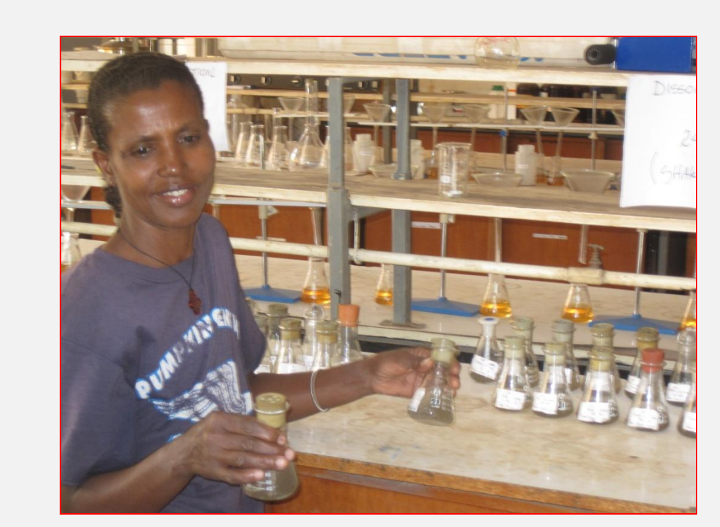
Fig. 1: A lab technician shaking bonemeal with coffee wastewater (left) and an illustration of the pot experiment in a greenhouse (right) at Hawassa University.