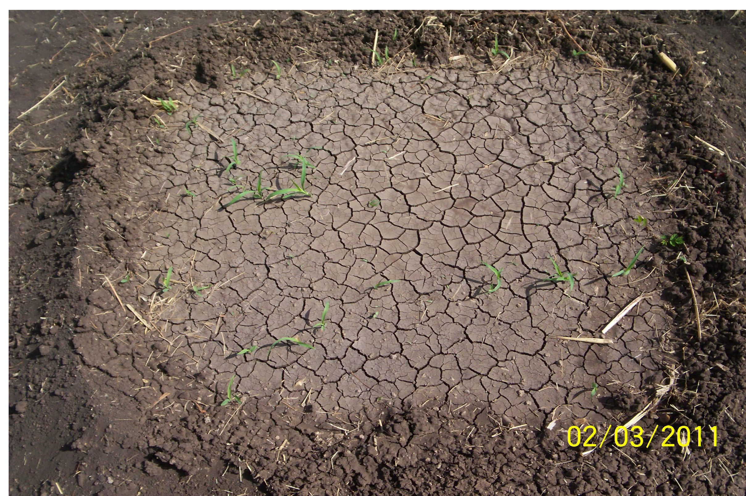
Figure 2. Emergence but much plant death during a 2-week dry period following water application at planting.

Application of 30 mm of water after planting followed by no water application for 15 days was especially detrimental; many plants emerged with this water deficit scenario but died during the 15-day period dry period (Fig. 2). Sorghum better tolerated the water deficit with no water applied at planting and seed lying in dry soil for 15 days before water was applied, compared with water deficits scenarios involving water applied after planting.