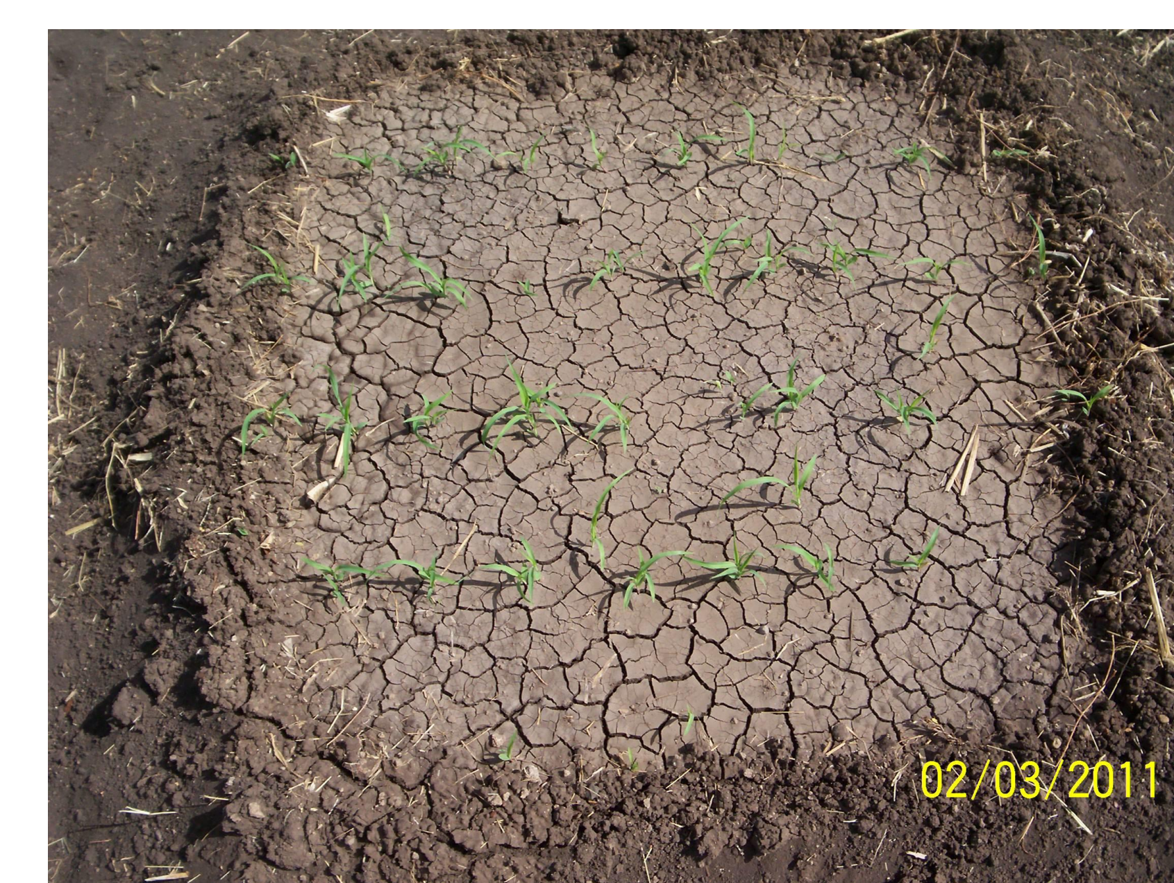
Fig. 5. Establishment of Masuki Adi dry soil planted at 5-cm depth with no water applied until 15 days after planting.