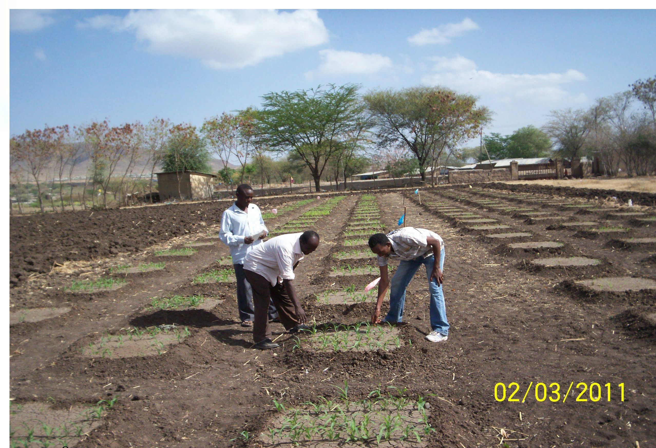
Figure 1. Dry soil planting of sorghum in Ethiopia