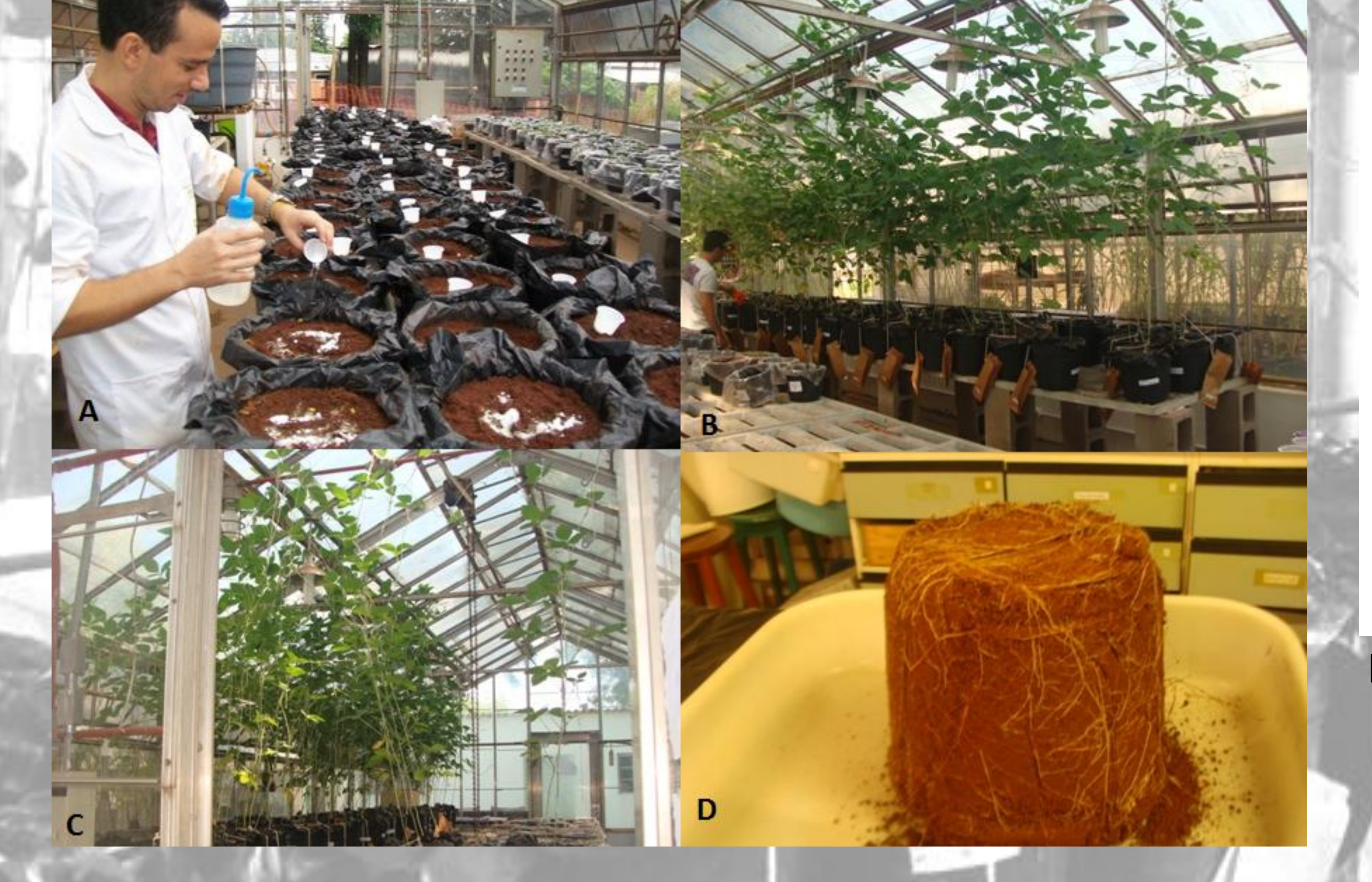
Figure 1. A: application of fertilizers, B and C cropping soybean; D a separation roots and shoots.

The experiment was carried out in greenhouse conditions. It was used two soil base-cation saturation ratios (50 to 70%) with five Ni rates (0, 0.1, 0.5, 1.0 and 10 mg dm<sup>-3</sup>) applied to Hapludox soil. Soybean plants was grown until the early grain filling stage (R5), when it was harvested and fractionated, on shoot and root (without nodules).