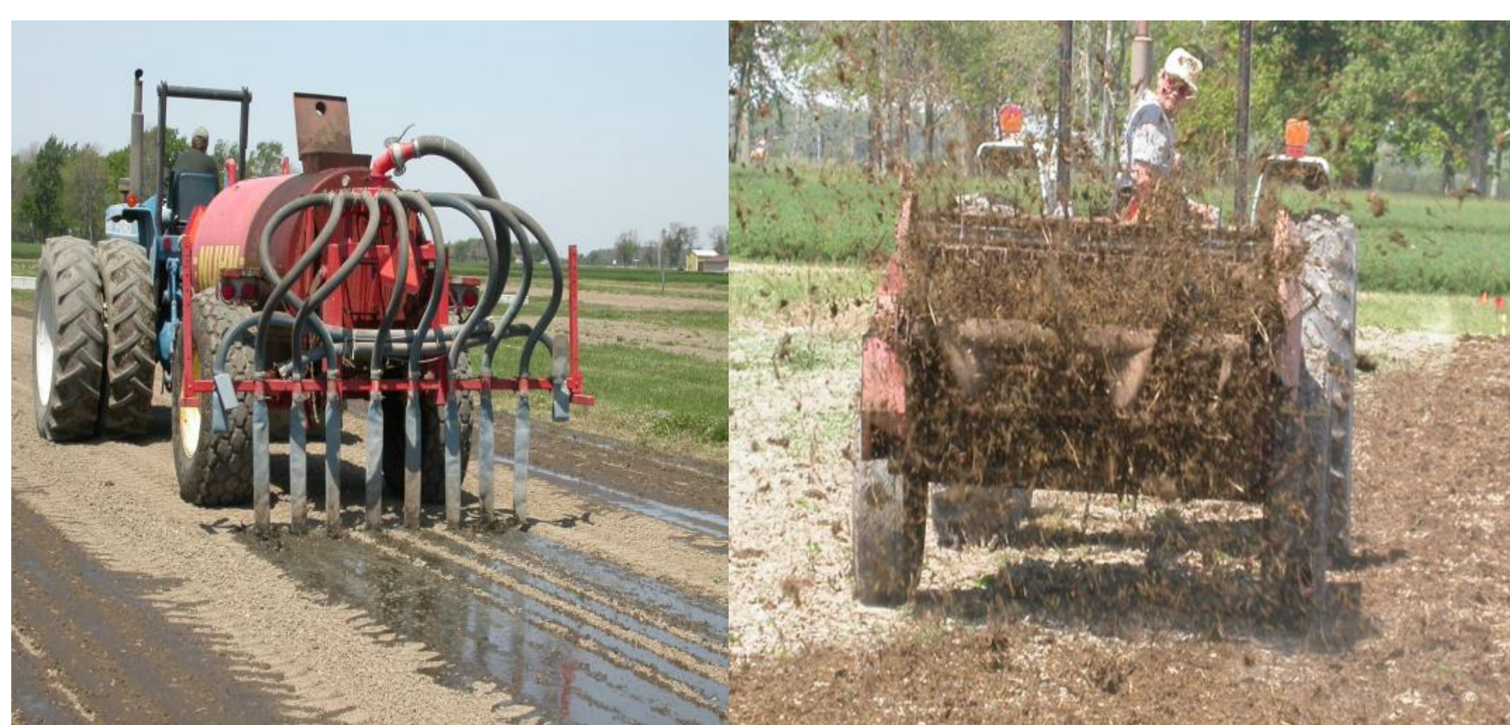
Fig.1. Application of liquid (left) and solid or composted swine manure (right).