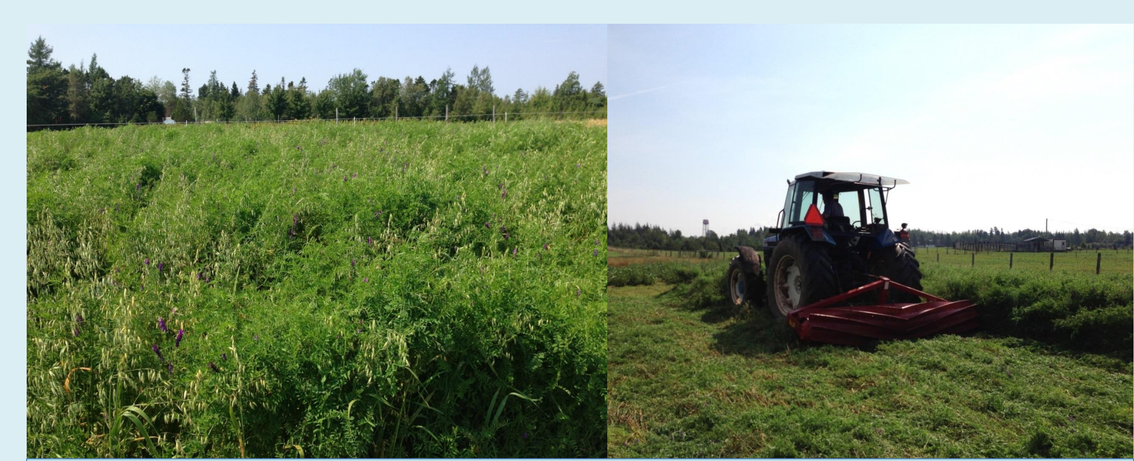
Figure 1. Hairy Vetch green manure (left) and no-till termination using a crop roller (right)