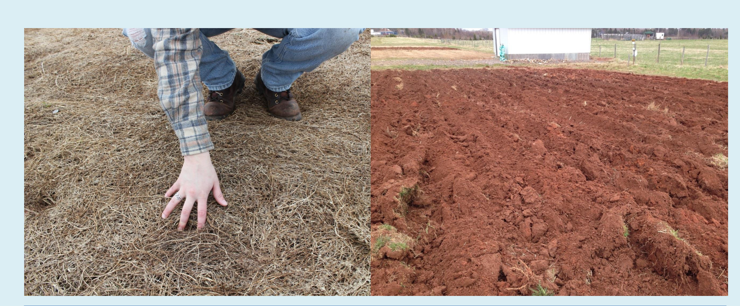
Figure 2. Mulch remaining after no-till termination (left) vs. tilled plots (right) in the spring of 2014