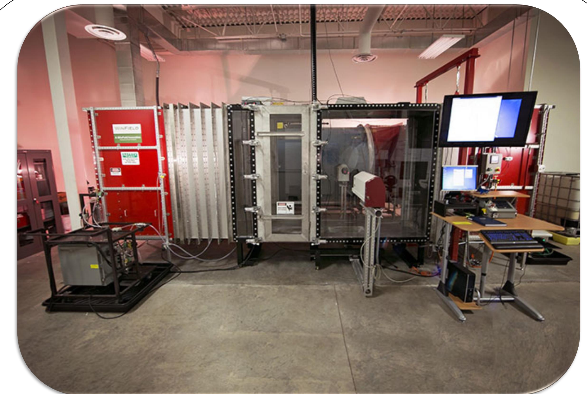
Figure 3. The % of particles < 105 µm in diameter were measured in a wind tunnel.

Although all drift retardants had a positive effect on drift reduction in the field trials, 13064 in particular had a significant reduction of drift with 64% less drift than the control. In fact, 13064 had 30% less drift than Competitor C, the top performer (Figure 1a). Although, 13064 did not produce the least amount of particles < 105 µm in the wind tunnel tests it did compare very well overall with a 37% reduction over the control (Figure 1b). When Interlock® was added, TTI11003 reduced drift significantly over the next best performing nozzle, AIXR11003. When nozzles were compared without Interlock®, TTI11003 still significantly outperformed AIXR11003 (Figure 2a). In wind tunnel tests TTI11003 again showed an advantage with 88% reduction in particles < 105 µm over AIXR11003 (Figure 2b). Correlation between wind tunnel and field data proved to be very strong and significant with r=0.81. It is very important to know if wind tunnel data can be confidently used to replace field tests. With wind tunnel tests potentially replacing field tests dramatic savings on efficiency and cost can be expected in future studies. (Fritz, et al., 2012)