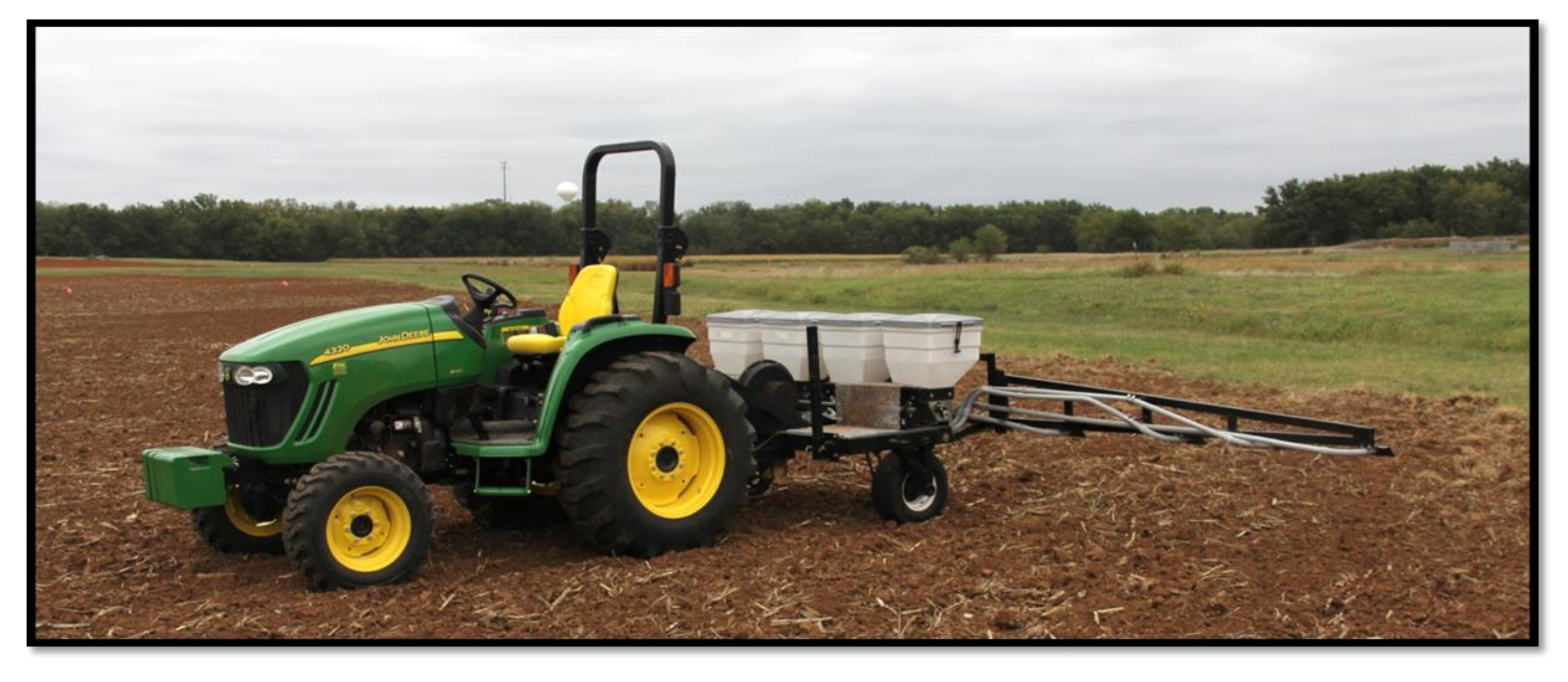
Figure 1. NPKS Applicator built by OSU Ag Engineering. Applicator used a PTO driven fan to blow fertilizer down boom and ground driven Gandy boxes to control fertilizer flow rate.