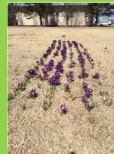
PHOTO 3. Crocus tommasinianus , cv. 'Ruby Giant' in the spring of 2014