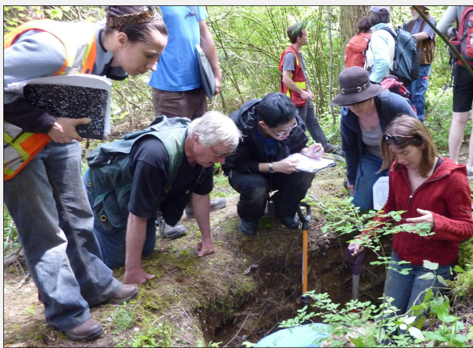
Expertise is possessed by relatively few. There is a risk of knowledge deficit for future generations

Soil description and classification are important skills for most natural resource professionals. Those who work in regions with extensive forest ecosystems, such as British Columbia, need to have an understanding of forest floor description, humus form classification, and the processes involved in forest floor development.