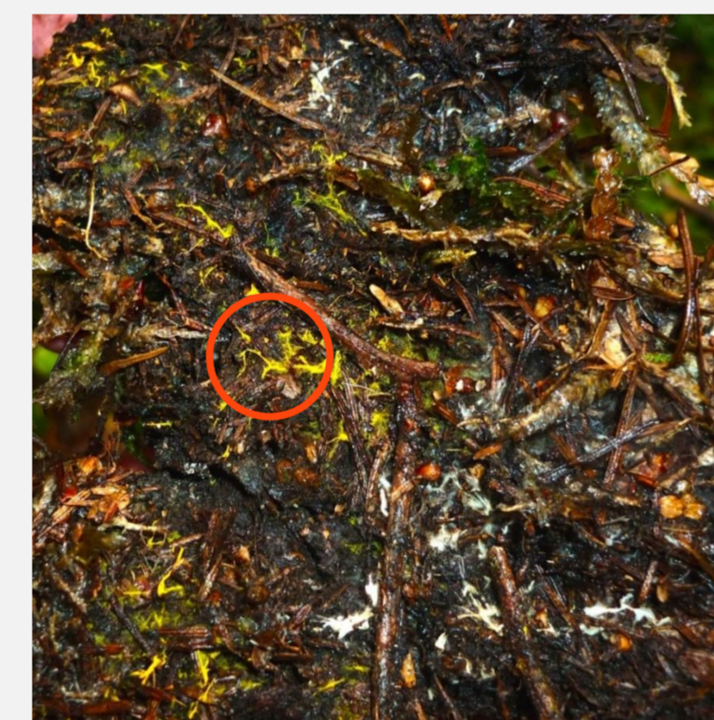
Graphic elements are used to highlight important properties of organic horizons, supplementing the text, videos, photographs and tutorial featured on the website. Fungal hyphae are highlighted here. (Graphic design: Claire Roan).