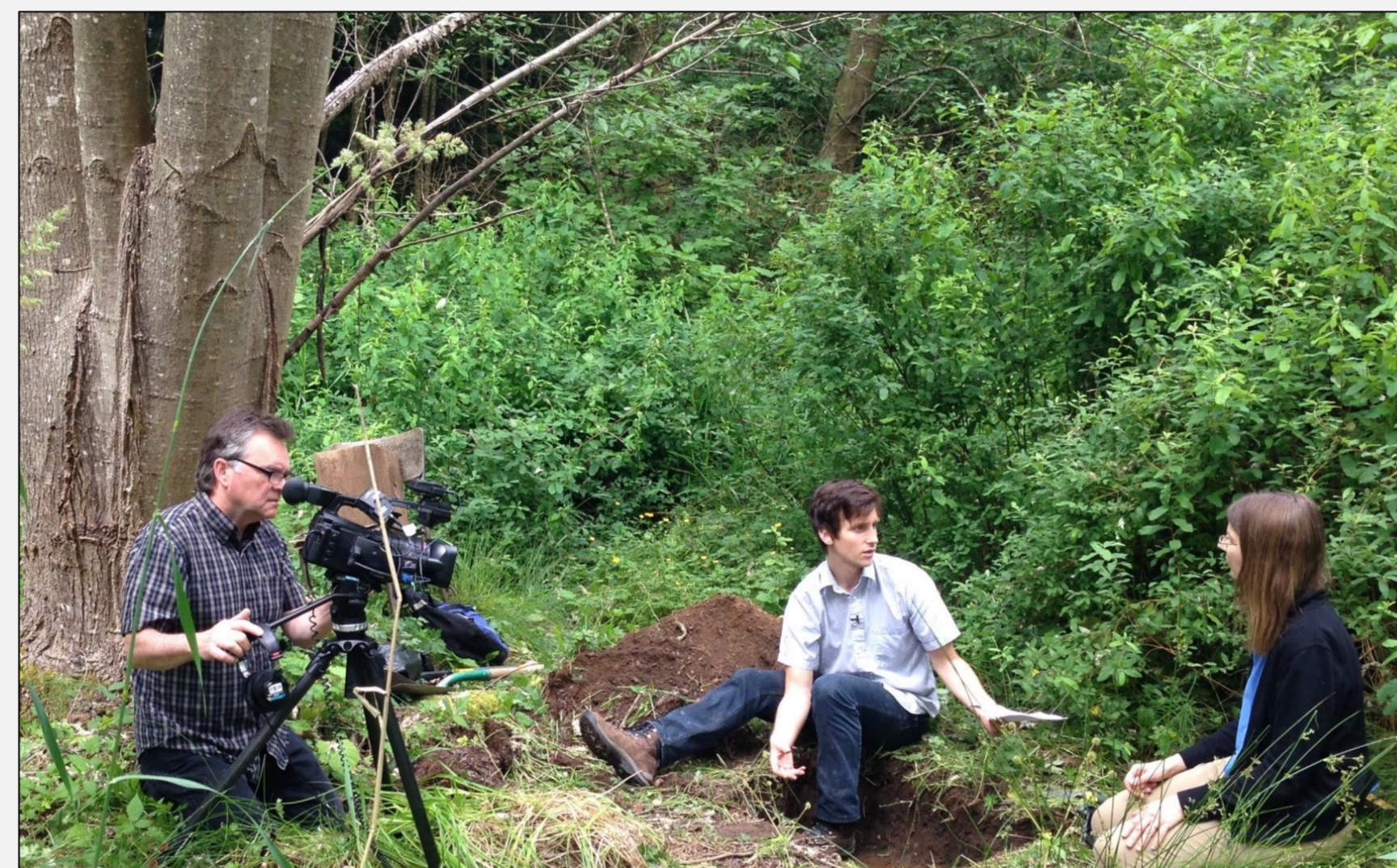
Videos feature interviews with an expert, explaining organic horizons, humus forms, ecological importance and how to sample and describe the forest floor.

The Forest Floor Tool is a multimedia website providing students the information to complete a humus form description and classification, while gaining an understanding of the important ecological functions of the forest floor.