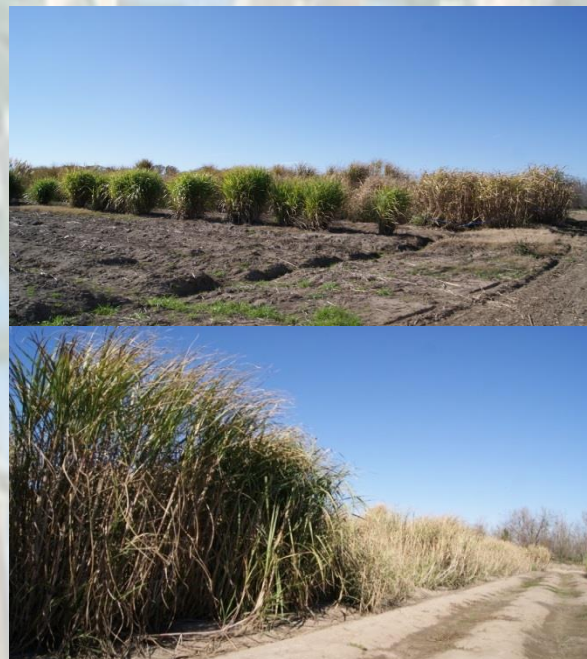
Fig 1. Progeny from energycane crosses between sugarcane and Miscanthus (top) and sugarcane Saccharum spontaneum (bottom). Note that compared with the other plants in the background, the energycane plants in the foreground in both pictures remained green after exposure to subzero temperatures.