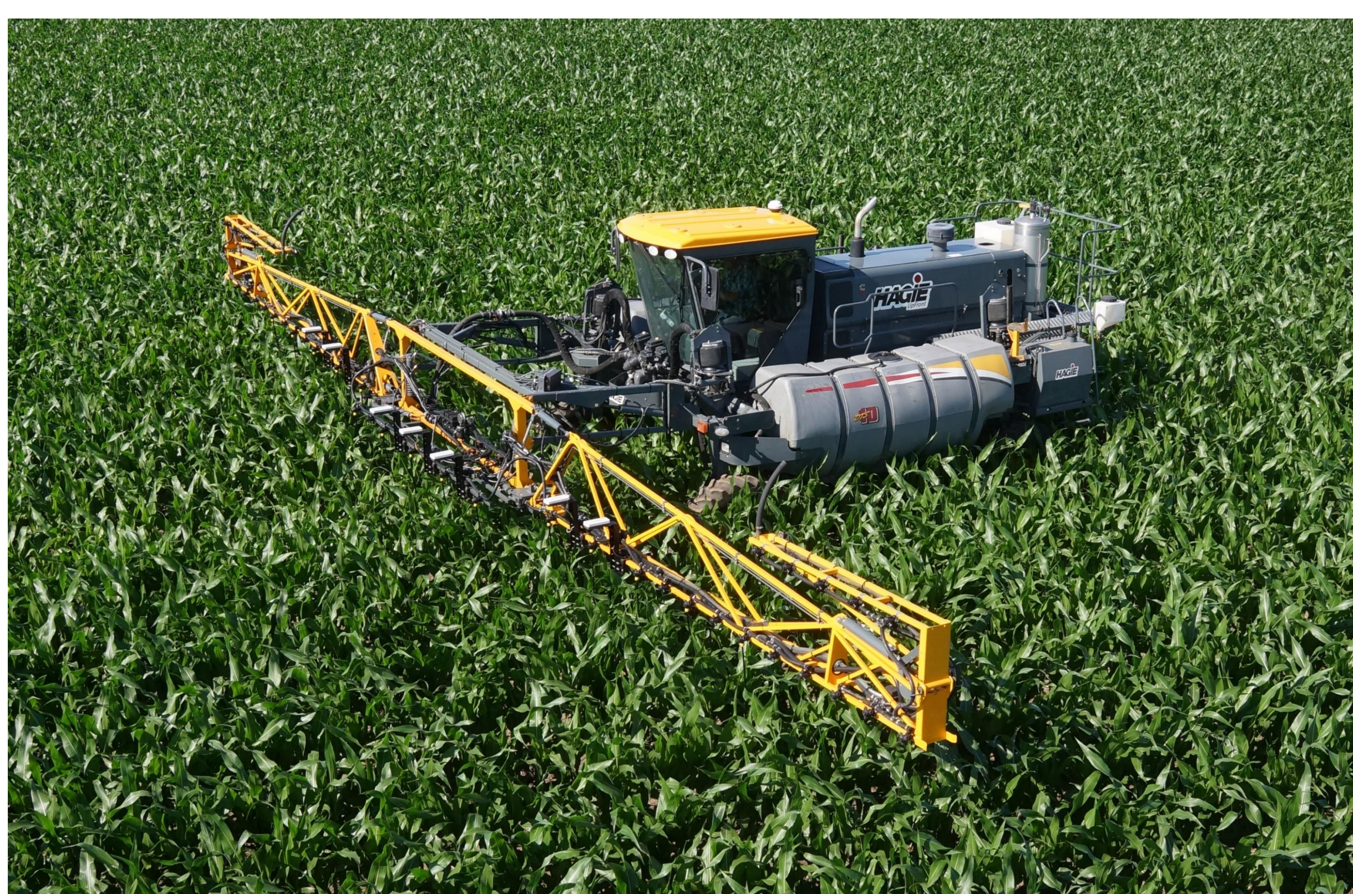
Figure 1: High clearance applicator with crop canopy sensors and drop nozzles used to apply the SENSE treatments.

Treatments were applied in a randomized complete block design with six replications. Harvest data was collected by the farmers' yield monitor in their combine. Yield data was cleaned and adjusted to 0.155 kg kg -1 moisture content using Yield Editor (v 2.0.7). As applied N rate was recorded for SENSE treatments; N rates for grower treatments were reported by the cooperater. Yield and N application points were averaged for each treatment strip. Data was analyzed and summarized using ArcGIS 10.3.1, and Proc GLIMMIX (SAS 9.4). Means were separated using Fisher's LSD.