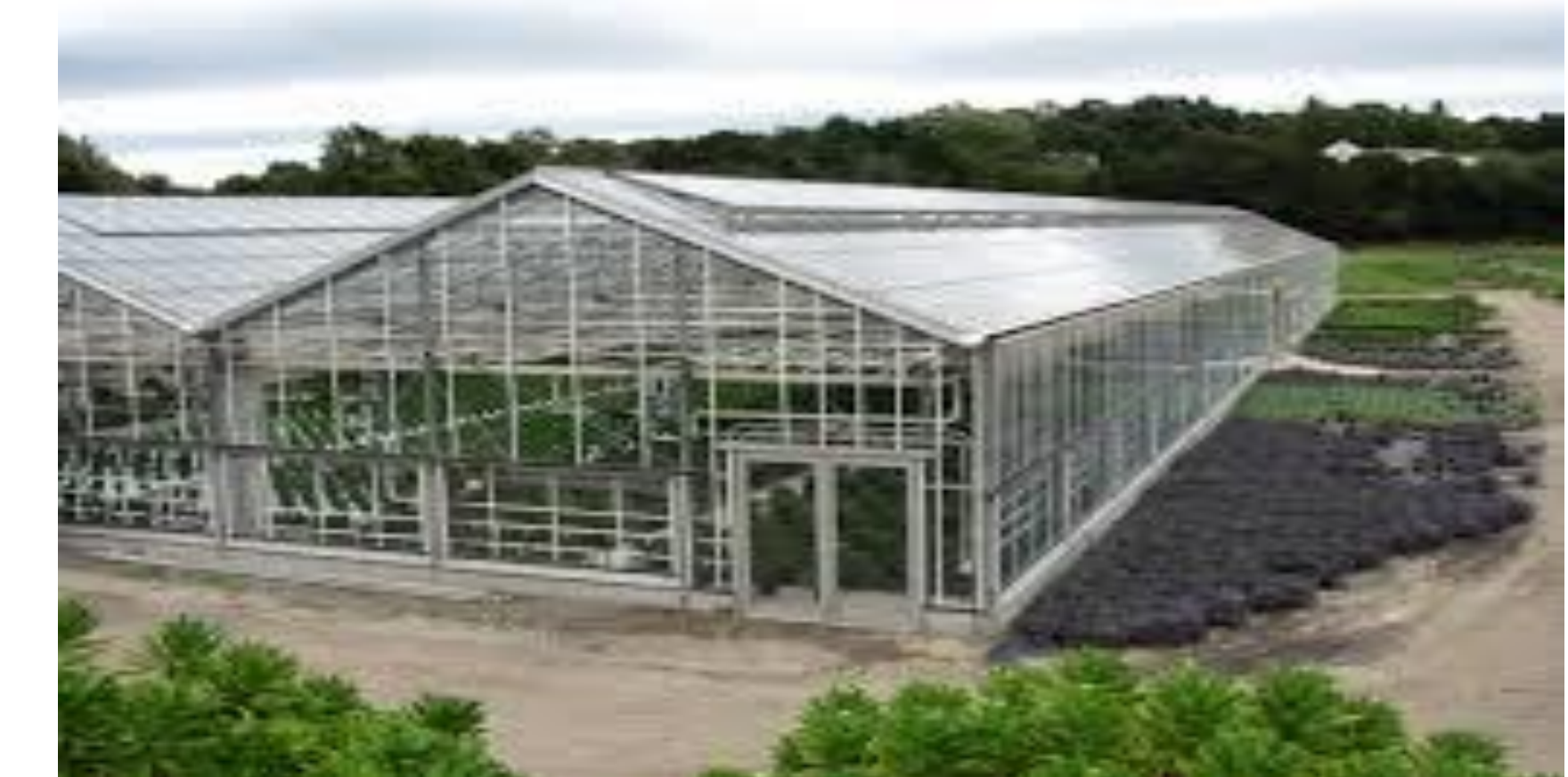
Table 1: Names, size, classifications and used parts for analysis.