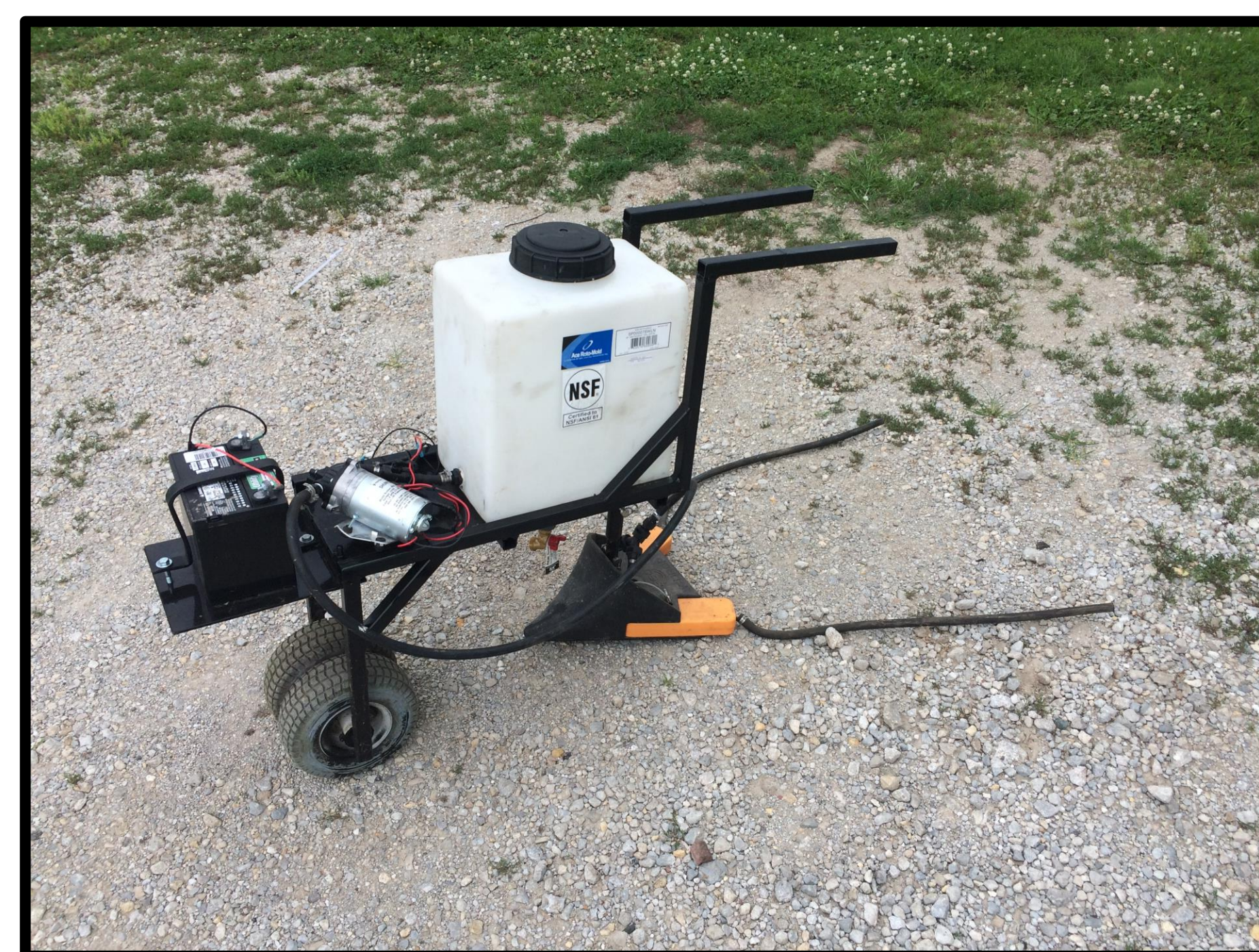
Photo 1. Single row Y-drop applicator developed for research by 360 Yield Center. This machine is designed to precisely place the nutrient solution on the soil surface directly next to the plant row.

V8 Sidedress: UAN blended with urease inhibitors: Agrotain or Nutrisphere, or UAN blended with Humic Acids: Hydra-Hume or Growth Boost, and compared to UAN by Y-drop with no additive.