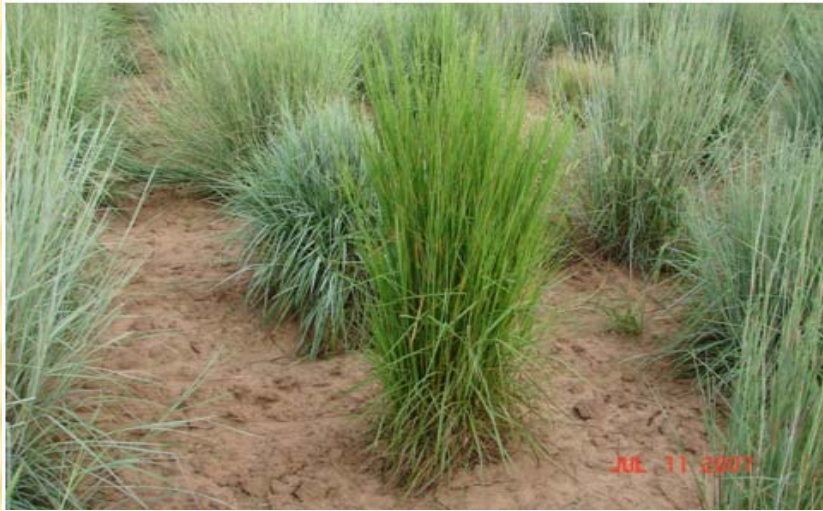
FIGURE 1-LITTLE BLUESTEM CANOPIES

Left - An upright-compact (UC) plant was defined by a columnar shape and erect culms.