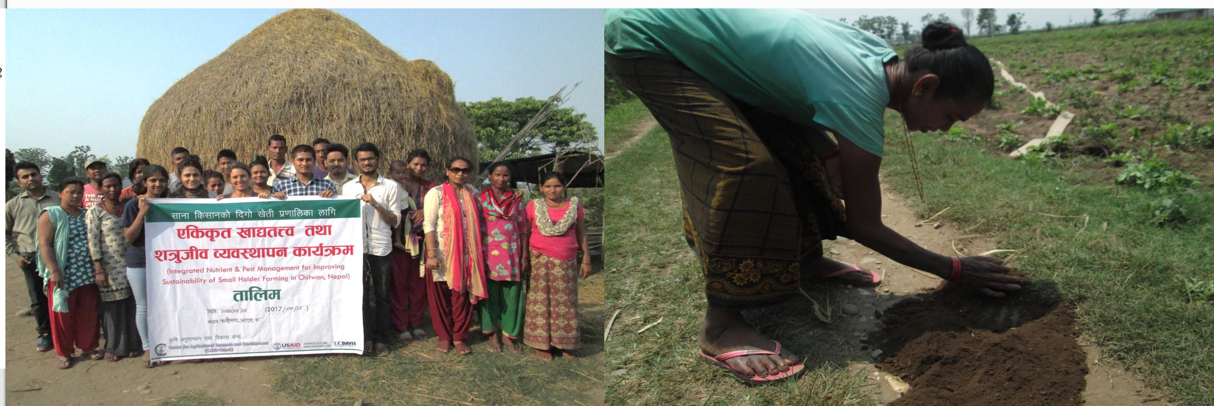
Fig. 4. Farmers' trainings and soil test demonstrations at different locations in Chitwan, Nepal.