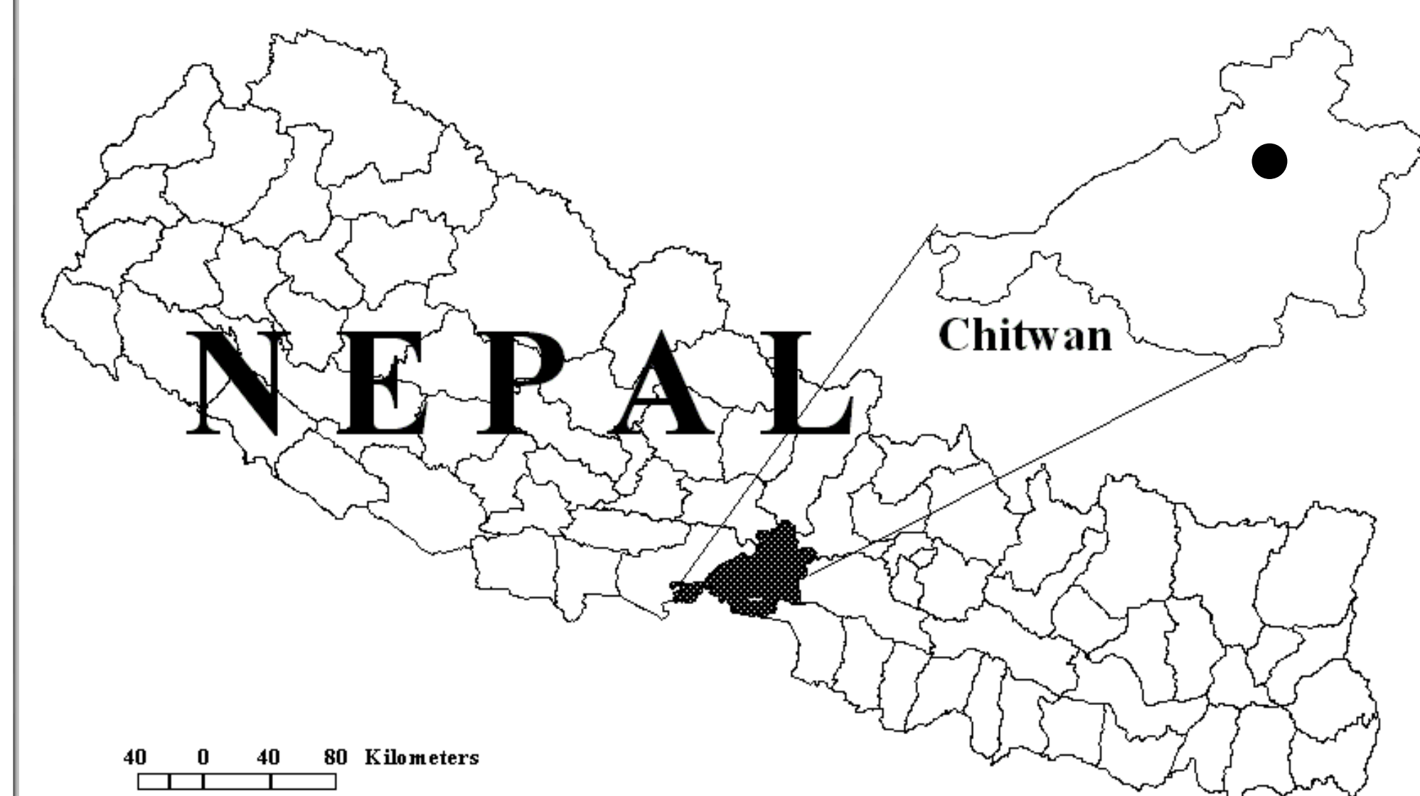
Fig. 1. Study area for a participatory soil testing and nutrient management trainings in Chitwan, Nepal.