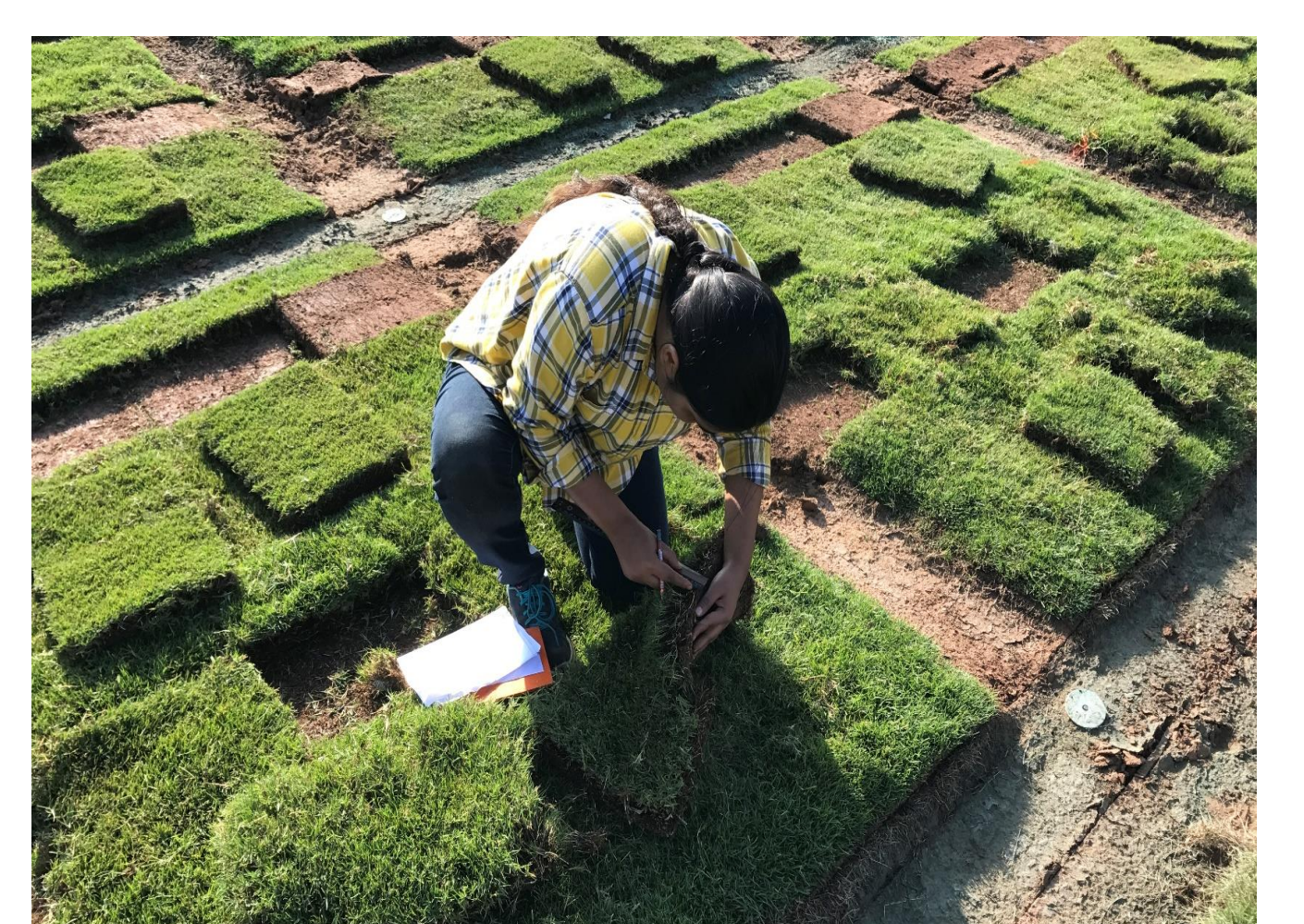
Figure 3: Sod tensile strength measurement device with force transducer/recorder system.