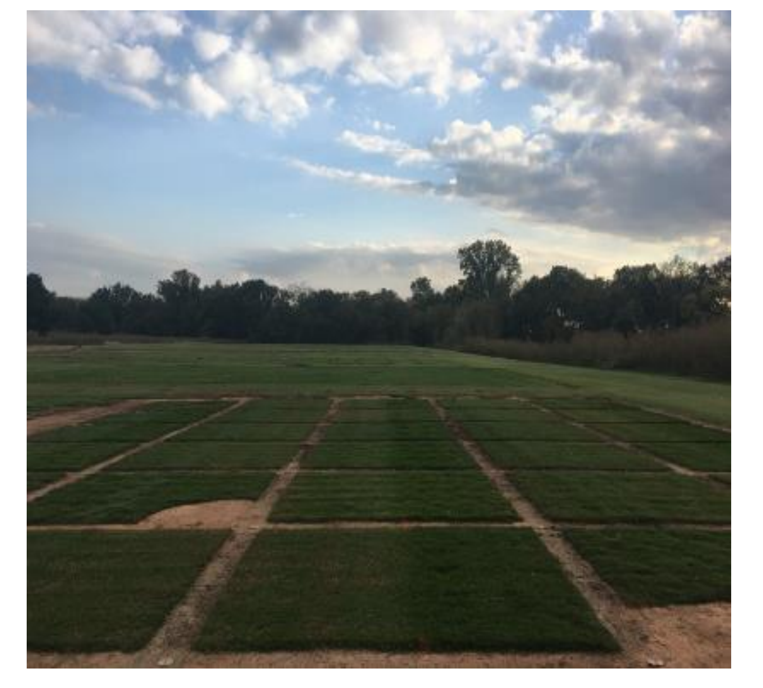
Figure 1: 2016 NTEP Seashore Paspalum Trial at The Botanic Garden at Oklahoma State University.

To assess the sod handling quality (SHQ) and sod tensile strength (STS) of 10 entries of seashore paspalum grown at two mowing heights (2.5 cm and 7.6 cm) and two harvest dates.