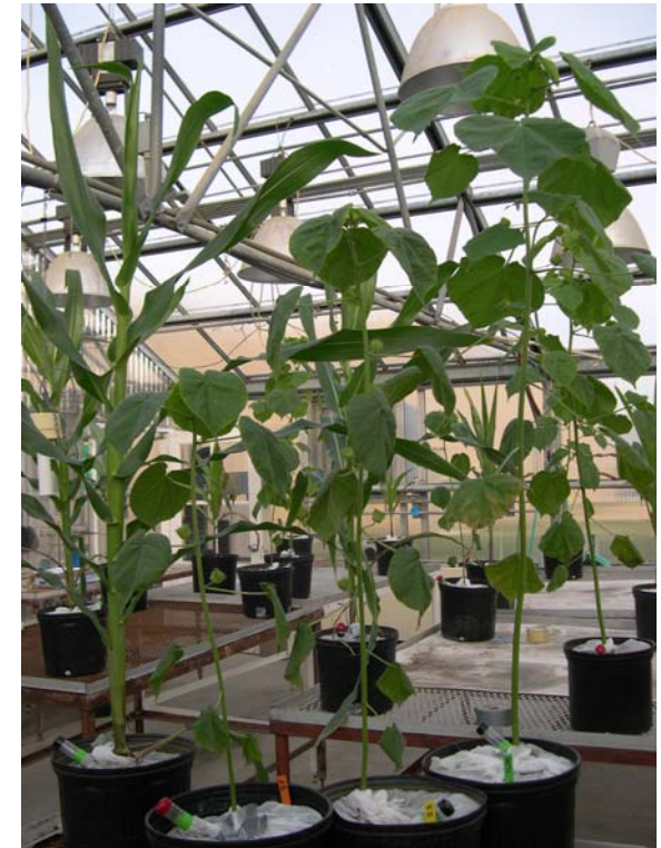
Photo 1. Corn and velvetleaf near the end of the first trial.