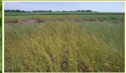
Figure 4. Camelina in mid June 2008 that was planted mid September 2007. The crop was harvested the end of June.