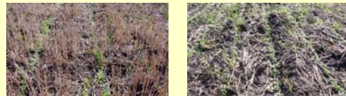
Figure 1. Camelina on Oct 22, 2007 in no-till and chisel plowed soil.