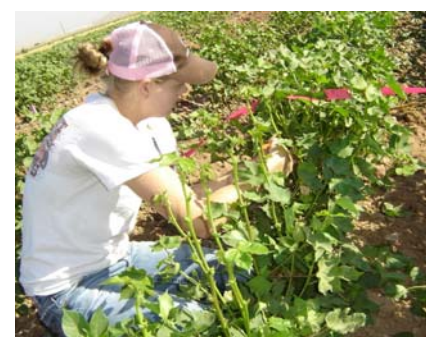
Figure 1. Fruiting branch removal