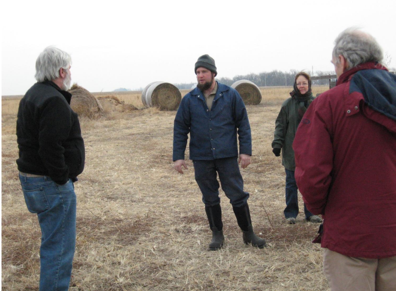
Farmer participants, KS and NY CEAP watersheds respectively