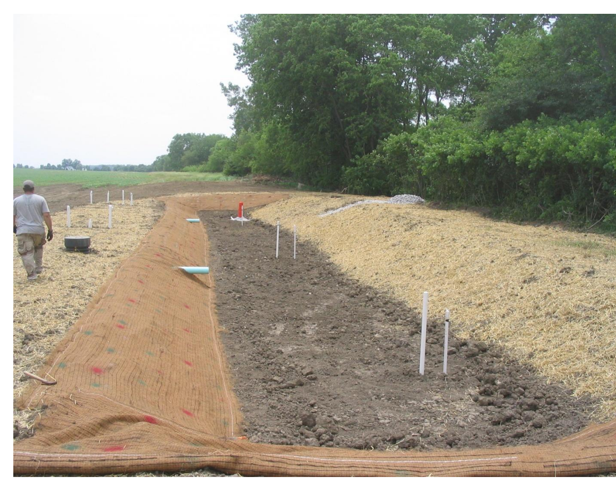
Bioswale, IN CEAP;