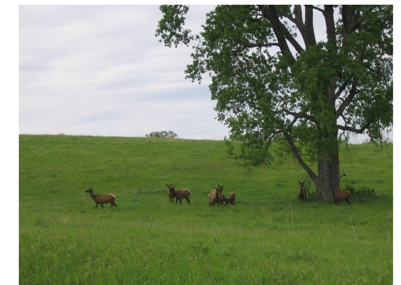
Prairie conversion, IA, CEAP