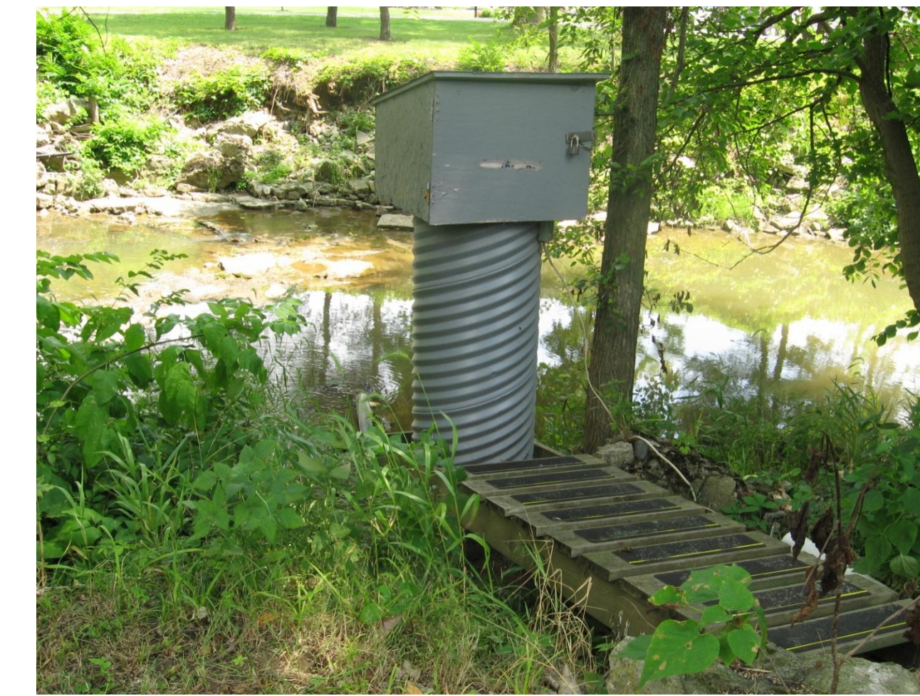
Sampler, OH CEAP;