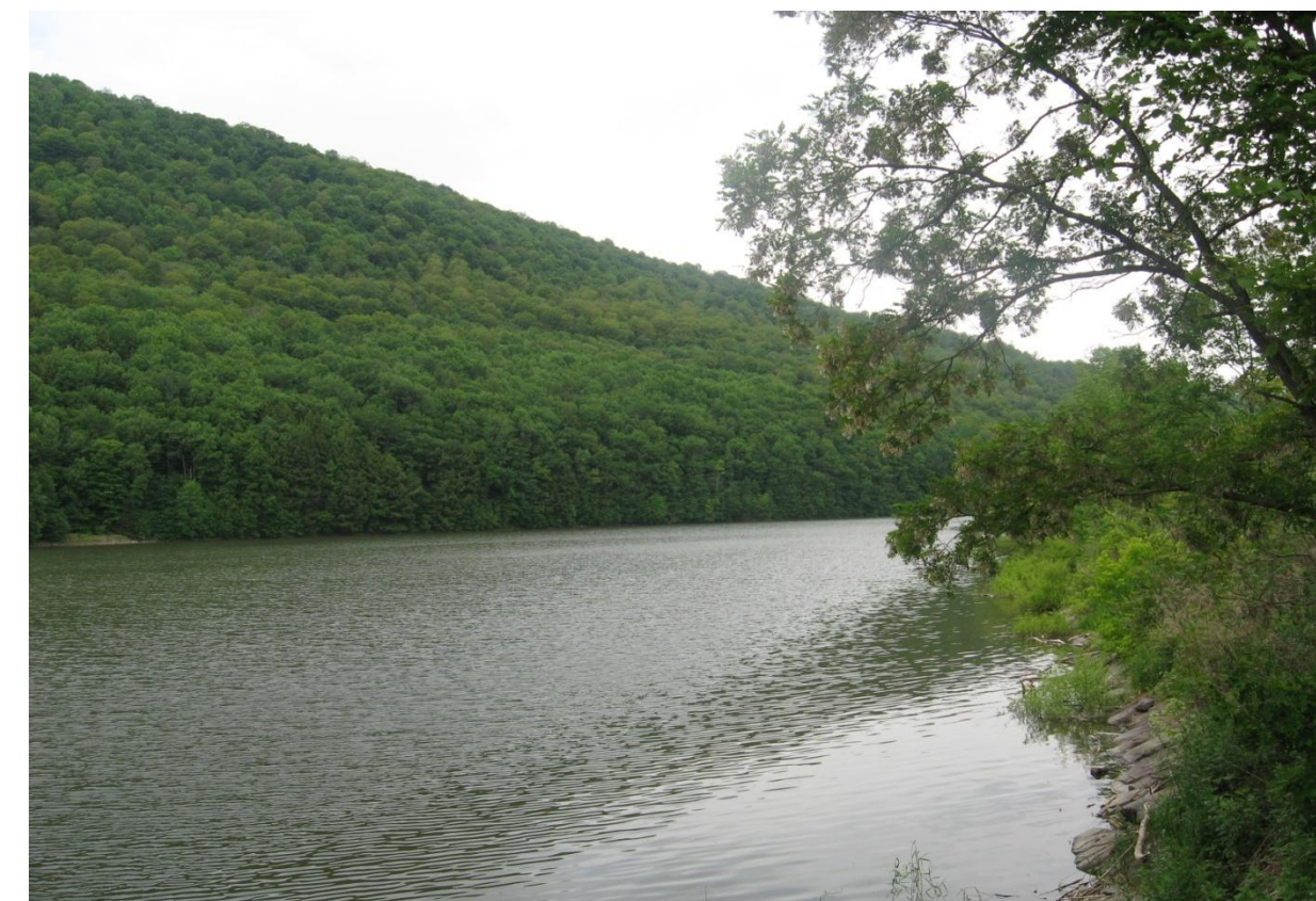
Cannonsville Reservoir, NY CEAP