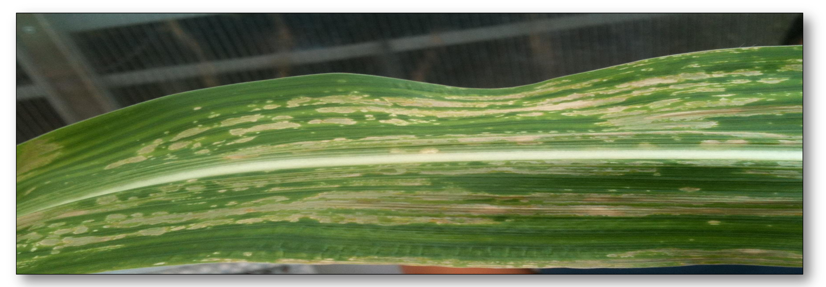
Figure 3: A section of a corn leaf that shows damage caused by foliar spray.

Figure 2: Corn grain yield [kg/ha] as a function of NDVI. Lake Carl Blackwell in 2011.