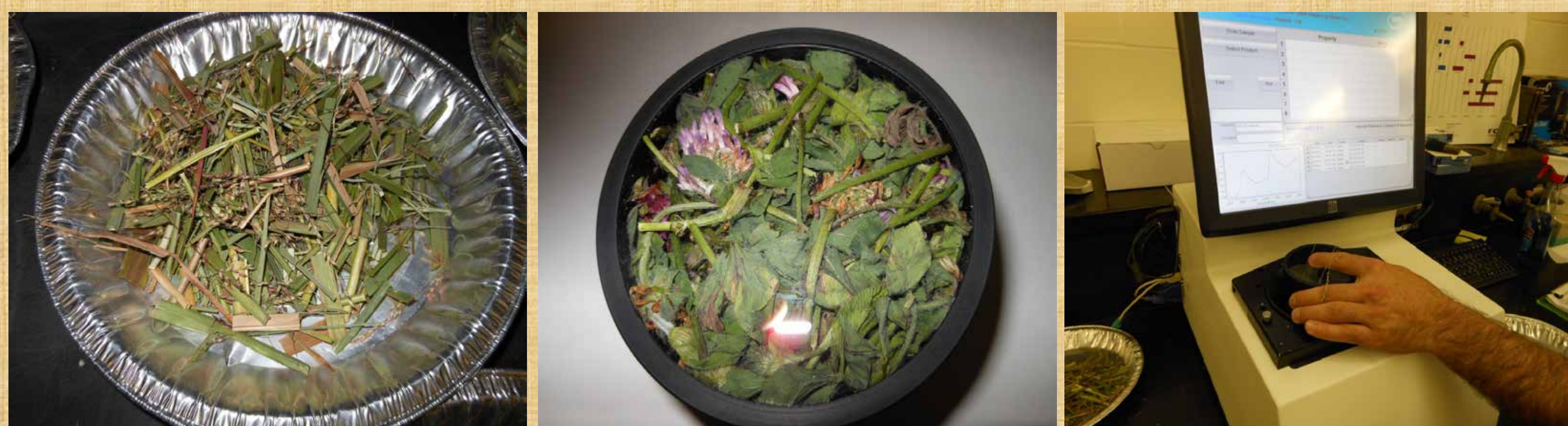
Figure 1. Form, handling, and instrumentation for fresh, coarsely-chopped samples.