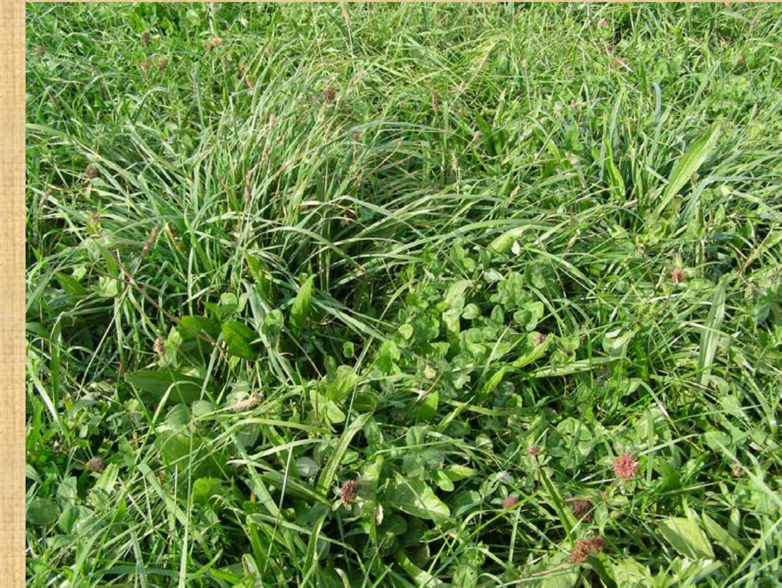
Figure 2. Typical botanical composition of mixed cool-season grassland.

Results. Equation development was successful for all botanical classes, with greater precision for dried/ground than for fresh/coarse forms (Table 1). Precision of estimation was lower for C 3 and C 4 grasses than for other components, but was similar among fresh and dried forms. Performance of equations on validation samples was highly variable, with low precision for many classes of fresh samples, but acceptable precision for many classes of dried/ground samples. Results suggest limitations to applications of field spectroscopy to in situ assessment of botanical composition of fresh materials.