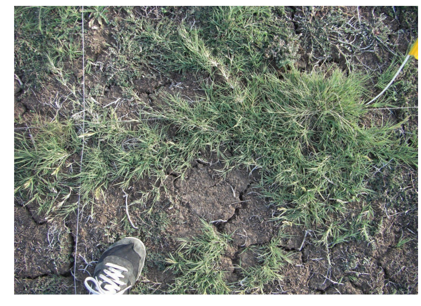
Top selection from 2012 nursery (14 weeks old)

(third generation seed) and it will be planted in the field in Spring 2013 for conducting progeny evaluations. If visual uniformity and mowing quality is deemed acceptable after conducting the progeny evaluations, the clonal parents from the 2010 polycross block could potentialli be used to develop a synthetic cultivar. These parents are currently being multiplied vegetatively in the greenhouse as a backup source of elite germplasm and to have material for seed companies interested in potential commercialization of a saltgrass cultivar release. A new source nursery was also planted in 2012 as an additional pool for selection. It is constituted of plants grown from bulk seed collected from the first generation. Initial data has been collected on shoot height and rate of spread of over 560 individual plants.