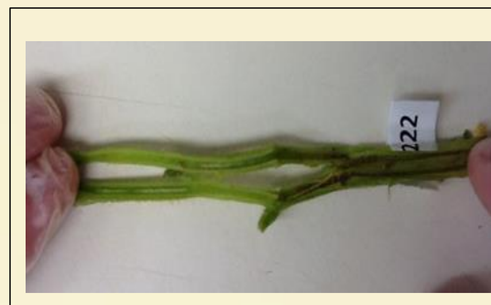
Figure 2: Incidence of discoloration was measured as the length of browning in the stem divided by the total plant height.