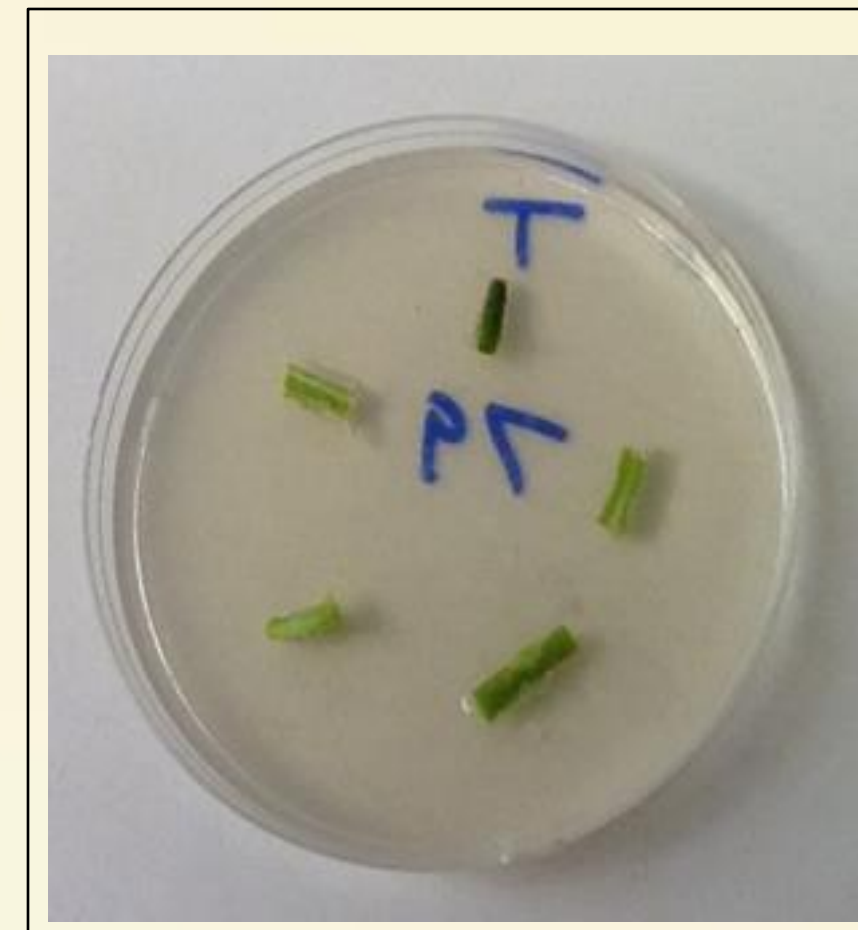
Figure 3: Recovery of P. gregata measured as colony growth around the stem segment.