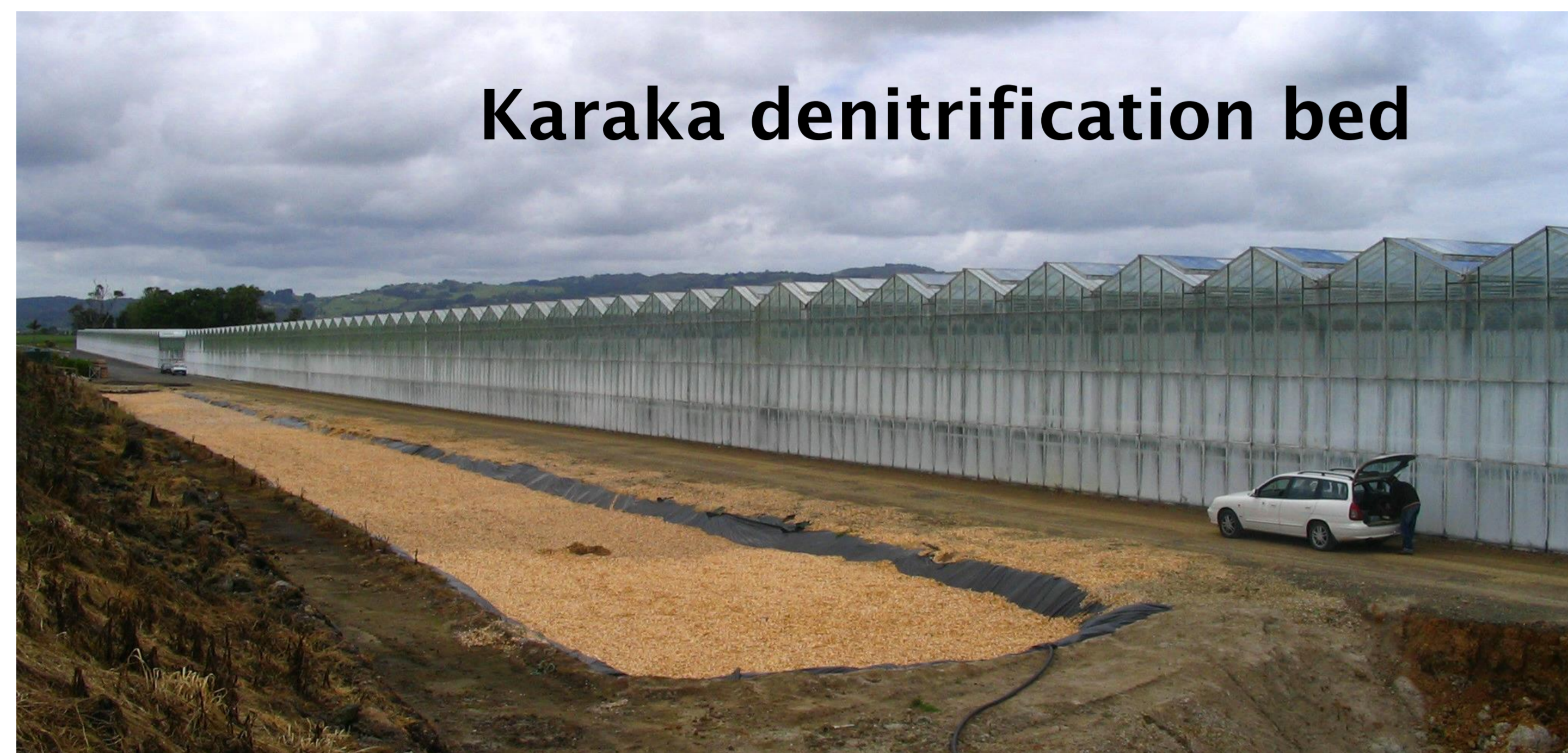
Karaka denitrification bed

Wells along the Karaka bed was sampled for nitrate concentration on multiple occasions along with flow rate and temperature measurements. Nitrate removal rates were determined from the product of flow rate and decreases in nitrate mass along the length of the beds (Warneke et al. 2011) and plotted against temperature. Temperature sensitivity was calculated as Q_{10} (the ratio of rates measured 10°C apart).