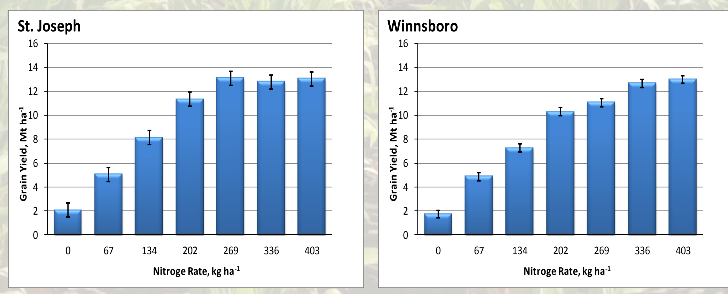
Figure 1. Corn grain yield response to preplant nitrogen at St. Joseph and Winnsboro sites, 2013.

in St. Joseph. E- Plot combine harvester. F- Soil sampling.