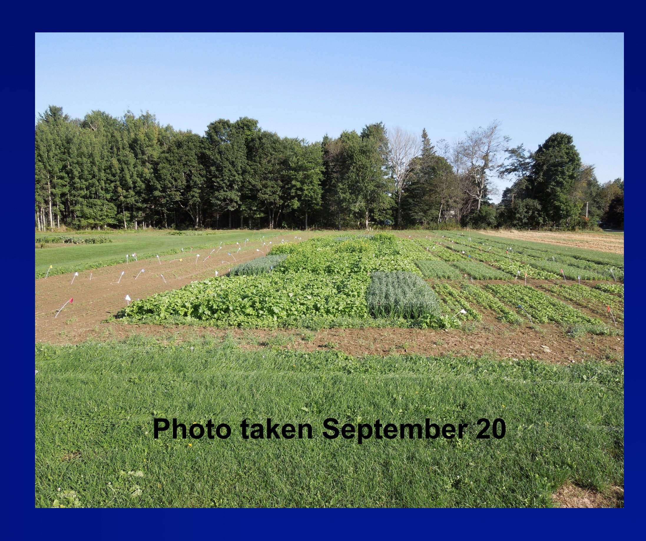
Figure 2. Mustard cover crops - 2012