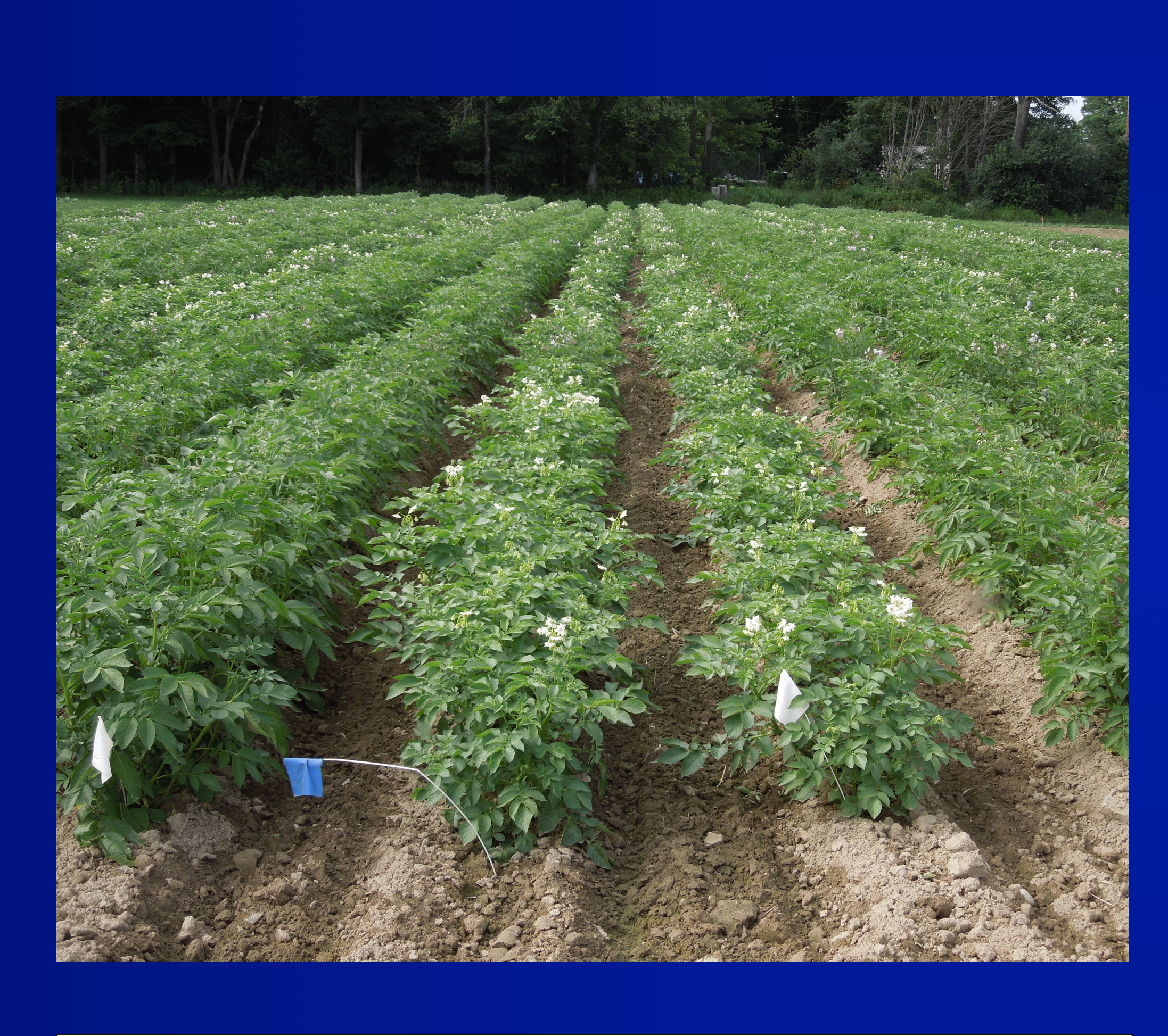
Figure 3. Carola and Yukon Gold - 2013