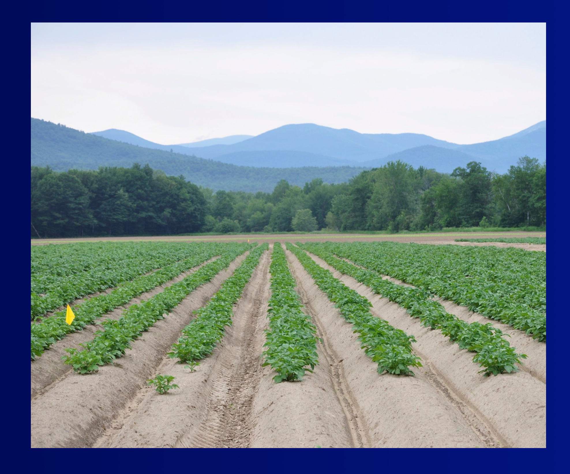
Figure 1. Potato Production in Maine