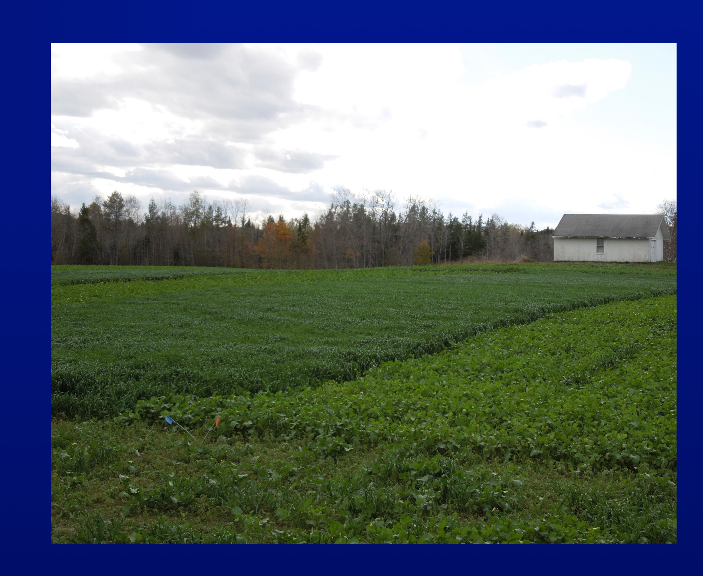
Figure 4. On-farm trial - Houlton Maine