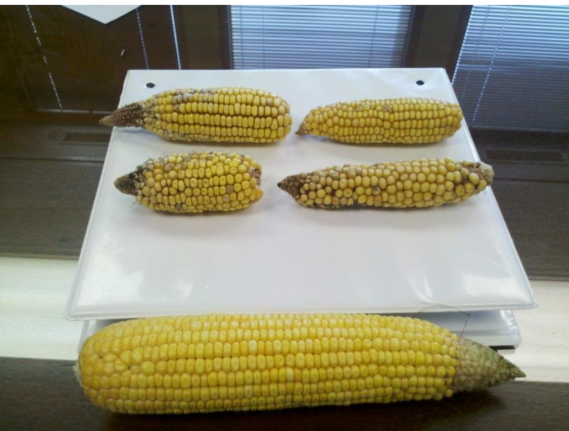
Figure 5. Ear size as affected by Mn (top) and untreated (bottom) in Nebraska.