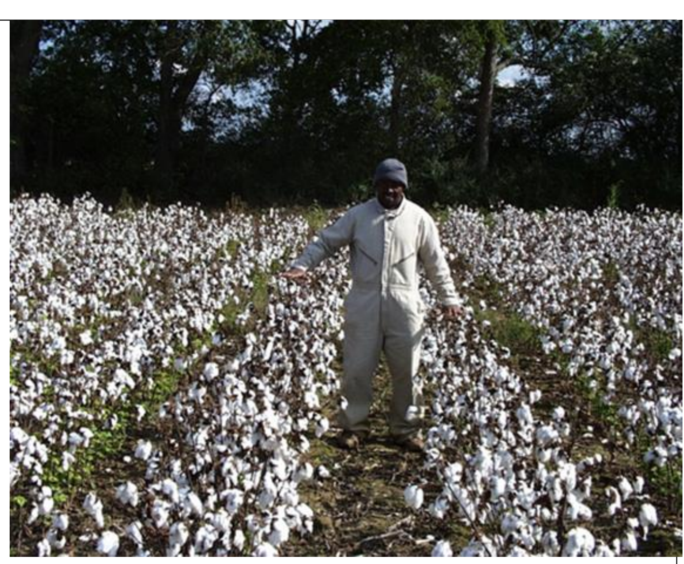
Figure 1. Manually applied manure on surface of Upper Coastal Plain site. Corn N response. Cotton N response.