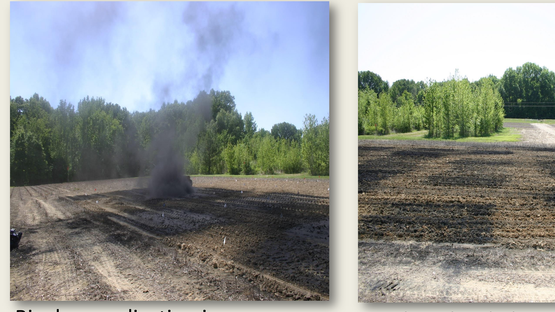
Biochar application in progress

Biochar application to soil is proposed as a novel approach to establish a long-term sink for carbon sequestration in terrestrial ecosystems. In 2012, an experiment was established at the University of Tennessee's Milan Research and Education Center in Milan, TN to determine the effects of biochar and nitrogen rate on soil chemical properties and corn yield. The experimental design was a split plot with nitrogen rate as the main plot and biochar rate as the split plot. Nitrogen rates used were 134 kg ha<sup>-1</sup> and 202 kg ha<sup>-1</sup>, and biochar rates were 0, 13, 27, and 67 Mg ha<sup>-1</sup>. The treatments were replicated four times on a Grenada silt loam (fine-silty, mixed, active, thermic Oxyaquic Fraglossudalfs) with a 0-2% slope. The biochar was applied dry using a drop spreader and then incorporated using a chisel plow followed by a disc to prepare the seedbed. Due to the extreme drought in 2012, no corn yield data were taken. In 2013, the corn was planted using no-tillage into the previous year's residue. Corn yields in 2013 and 2014 were significantly affected by N-rates with the 202 kg ha<sup>-1</sup> rate being higher, but there were no significant differences between bio-char rates. Soil organic carbon was significantly increased as biochar rates increased.