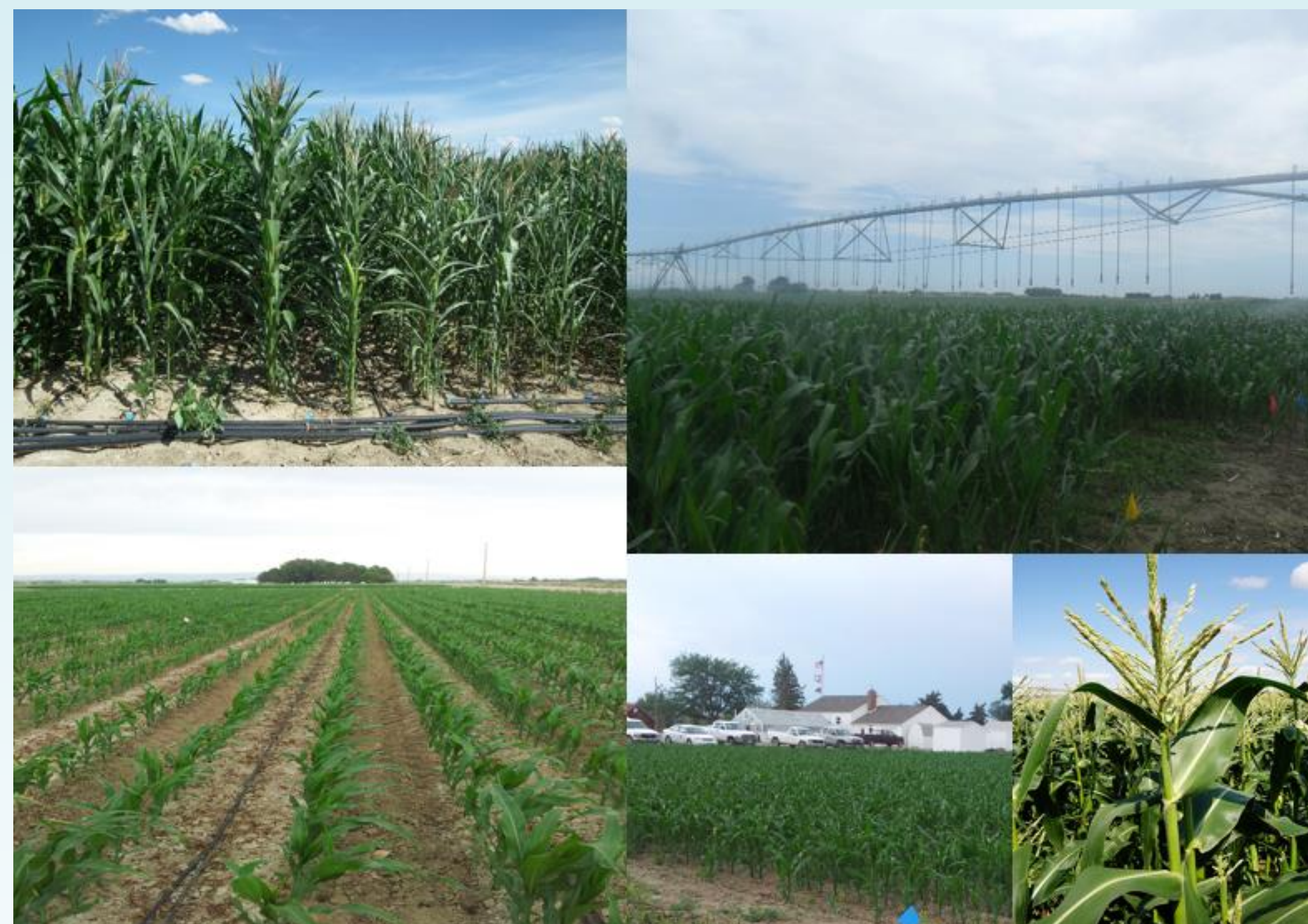
Picture 1. Corn for silage under sprinkler, on-surface drip and sub-surface drip irrigation systems.