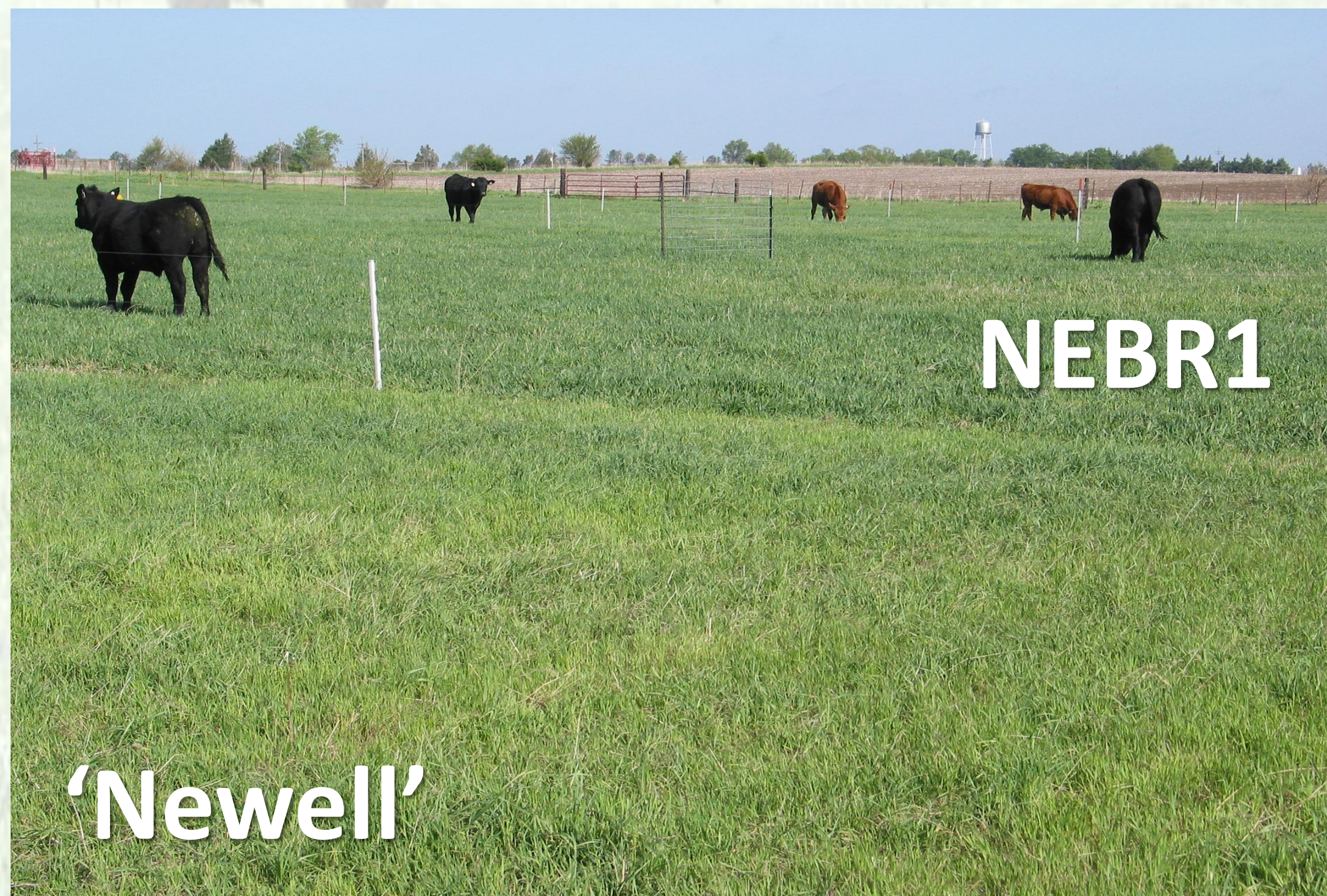
Figure 1. 'Newell' smooth brome grass and NEBR1 meadow brome grass.