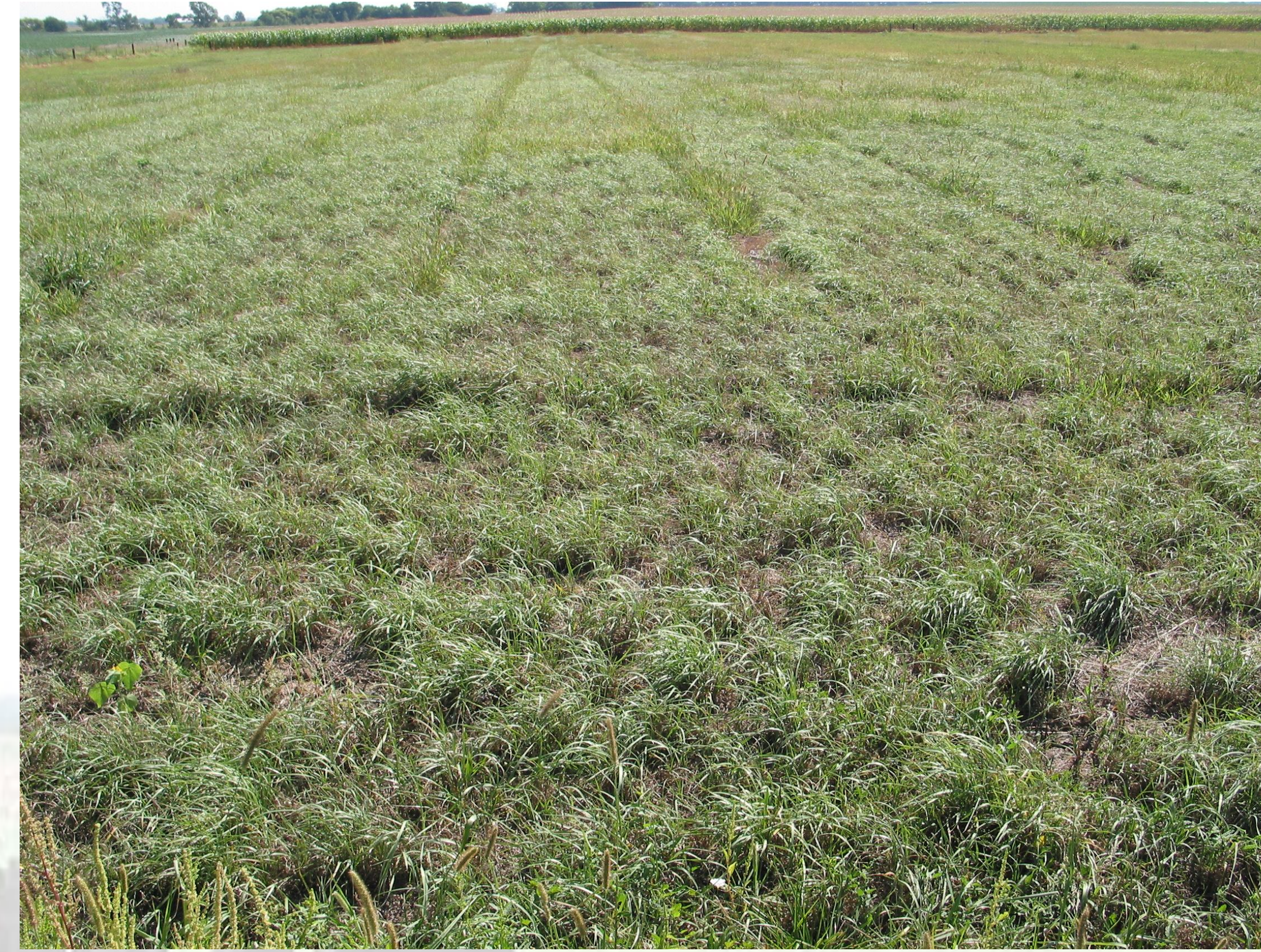
Figure 2. NE BR1 meadow brome grass pasture following 3-yr of grazing.