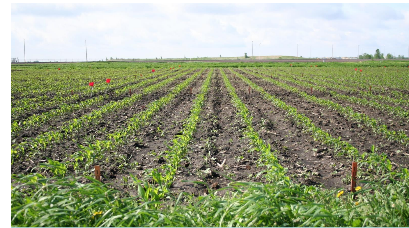
Treatment 2- Recommended rate of Vertisan™ tank mixed with Abundit® Extra, taken 0 DAT

Pioneer Hybrid 'P0533AM1' was planted into a conventional tilled, weed free, loam soil with 4% organic matter, a soil pH of 5.7 and a CEC of 16.9 in a RCB design with four replications. Postemergence applications of fungicide were made at the V3-V4 corn stage. Vertisan™ alone was applied at its recommended rate of 140 grams of ai/ha (9.6 oz. product/a) and at its 2X rate of 280 grams of ai/ha (19.2 oz. product/a) with non-ionic surfactant (NIS) at a rate of 0.25% V/V. Glyphosate (Abundit® Extra herbicide) at 840 grams of ai/ha and AMS at 2242 g ai/ha plus Vertisan™ were also included as tank mix treatments. Visual crop response was rated at 7 and 14 days after application as % injury using a scale of 0%= no injury/crop response/control and 100% = complete kill. Vigor ratings were taken at 0,7,14 and 28 days after treatment (DAT). Ratings were done both visually and using a Greenseeker Handheld Crop Sensor. Root mass dry weights and fresh shoot weights were taken for six plants per plot at 14 and 28 days after application.