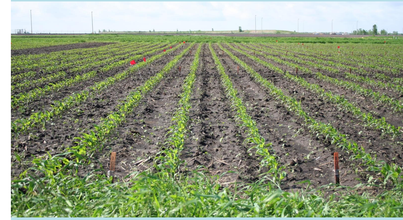
Treatment 5- Untreated Check, taken 0 DAT