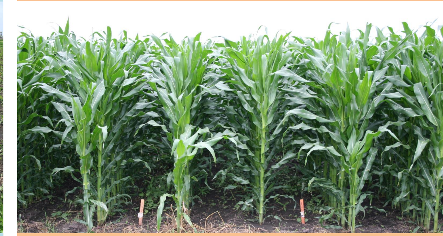
Treatment 5- Untreated Check, taken 28 DAT