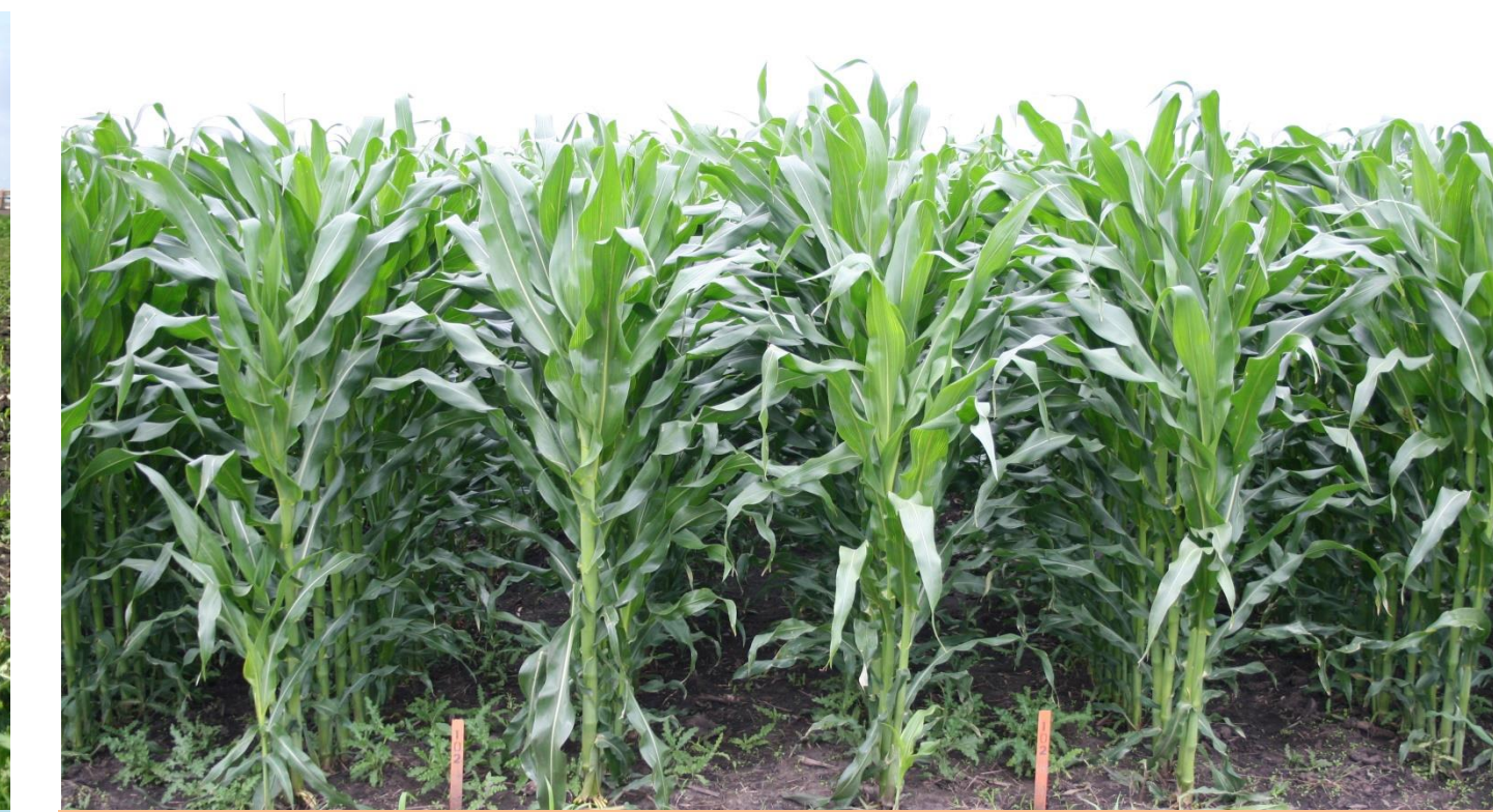
Treatment 2- Recommended rate of Vertisan™ tank mixed with Abundit® Extra, taken 28 DAT