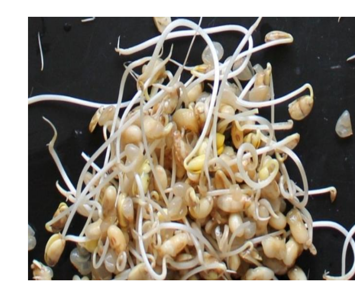
Figure 2c: Low quality sprouts