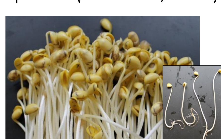
Figure 2b: Mid quality sprouts