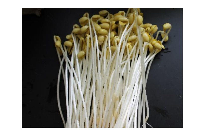
Figure 2a: High quality sprouts