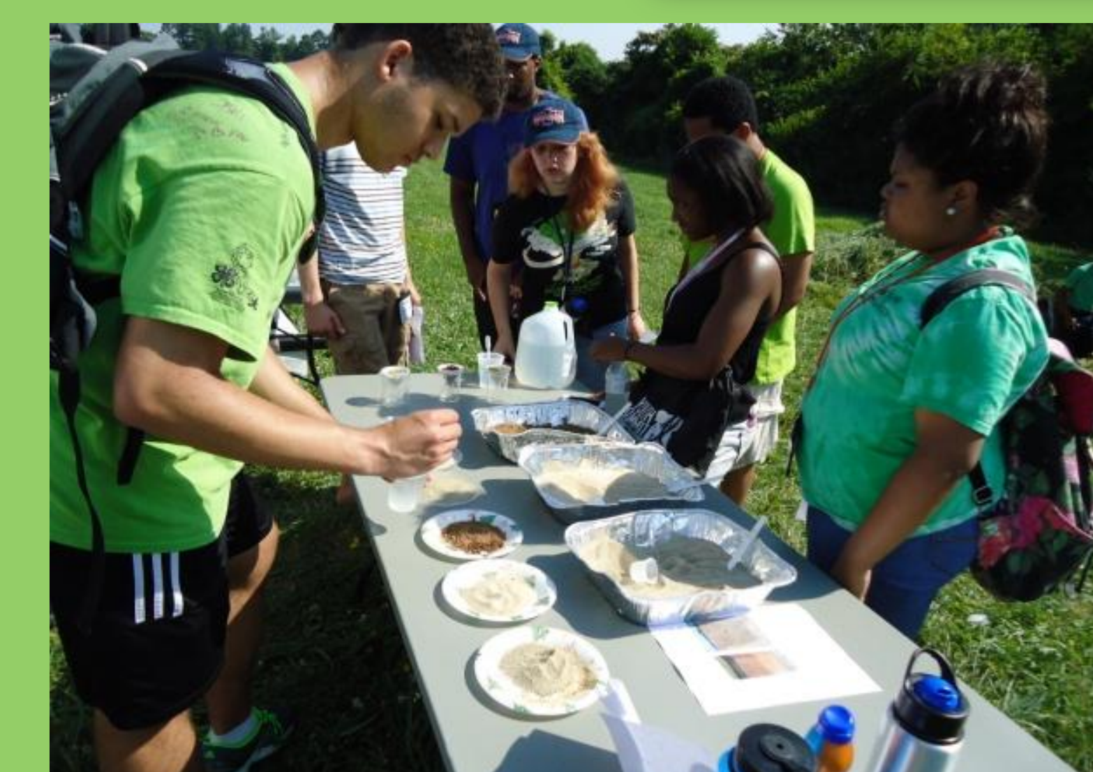
Figure 3: Students at various Activities