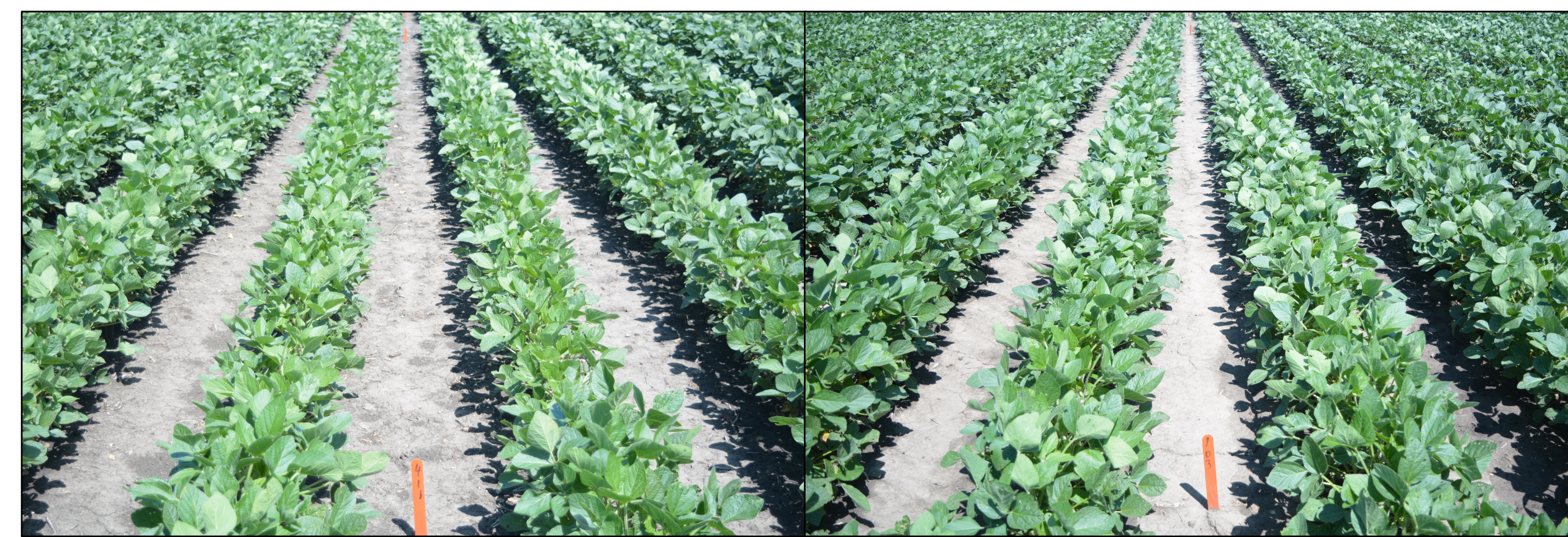
Figure 1. Visual stunting observed 21 DAT with lactofen (left) and fomesafen (right) at V3 application timing