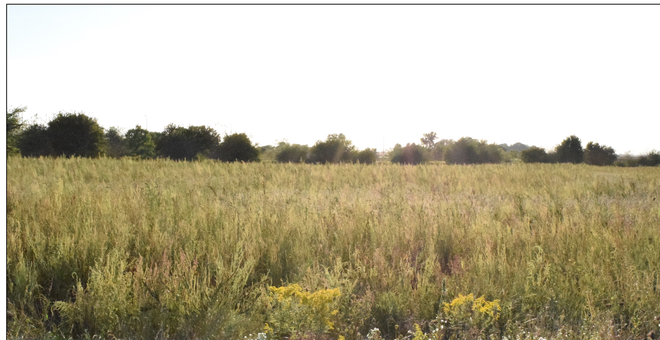
Example of a weedy field near Champaign, IL

The objective of this experiment was to evaluate whole crop injury as a result of two PPO-inhibiting herbicides applied at five different timings in a high yielding environment.