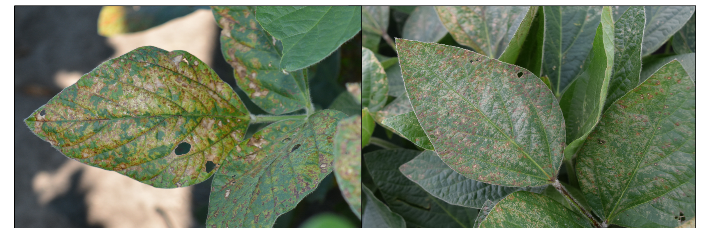
Figure 3. Lactofen symptomology (left) vs. fomesafen symptomology (right)

At constant yield, a potential inverse relationship between seed weight and pod count was observed. When pod count declined, seed weight increased (Figure 2). Additional studies would need to be conducted to validate this hypothesis.