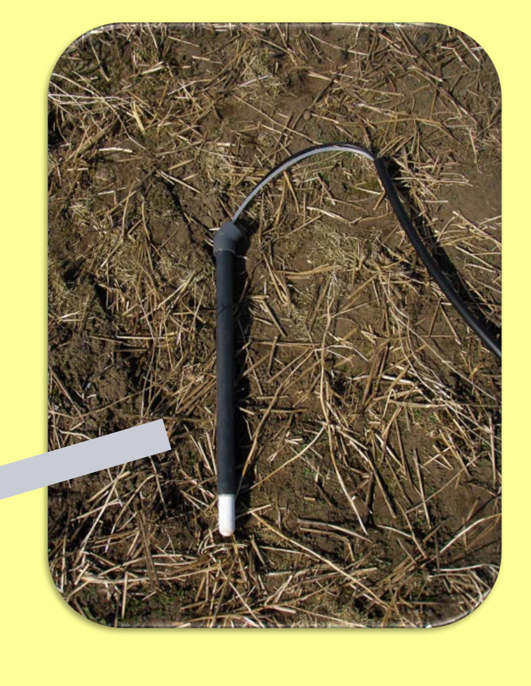
Installation of suction cups at Foulum, 2015.