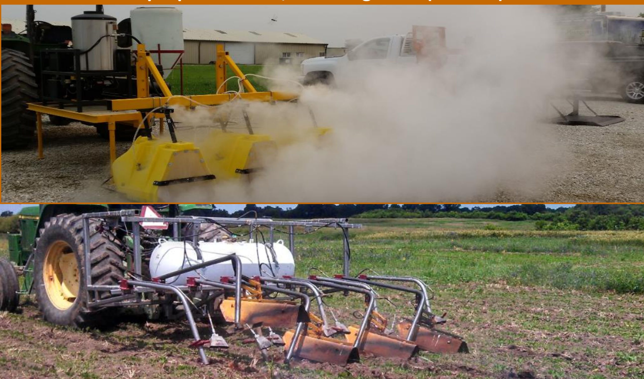
Figure 2. Effects of thermal weed control treatments on row crop soybeans and corn. Left to right: Hot water, tillage, propane flame